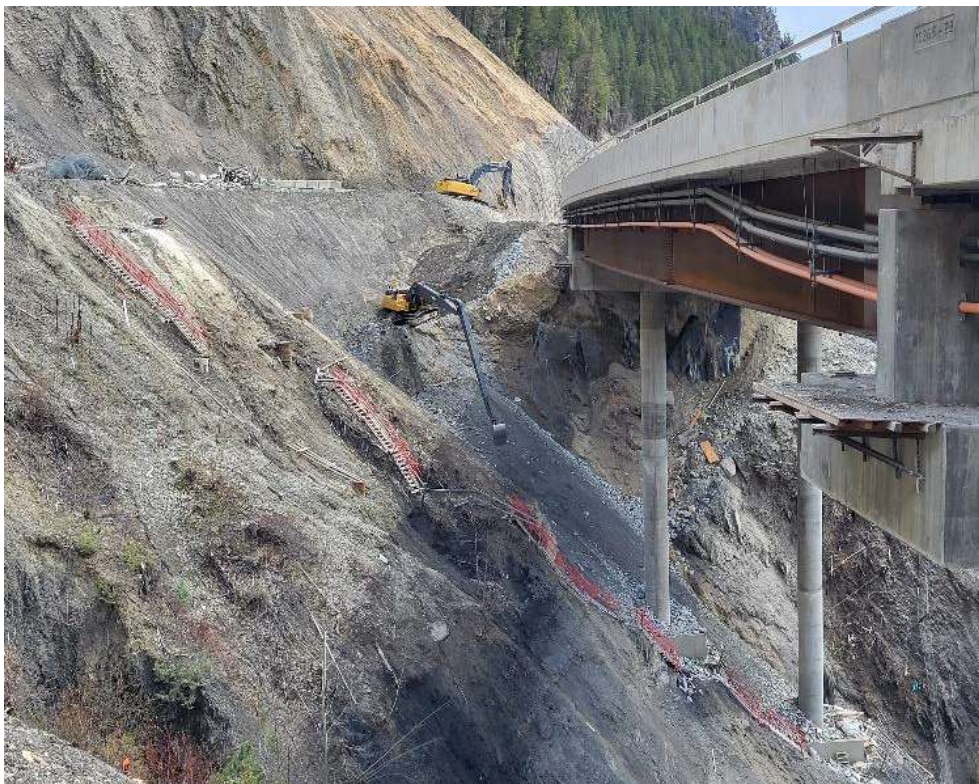
Figure 2: Blackwall Bridge – Sloping work ongoing – April 29, 2024