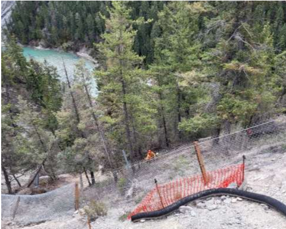
Figure 5: New snow protection fence installation ongoing – Sheep Bridge – April 24, 2024