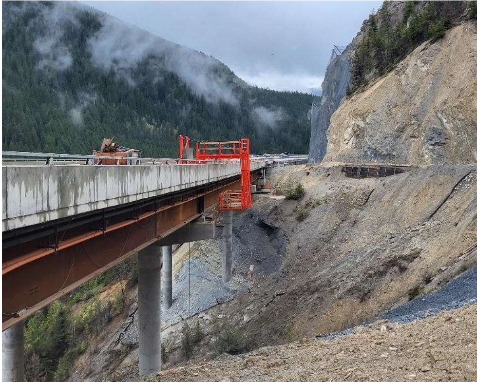
Figure 1: Removal of formwork at Big Horn Bridge near completion – April 26, 2024