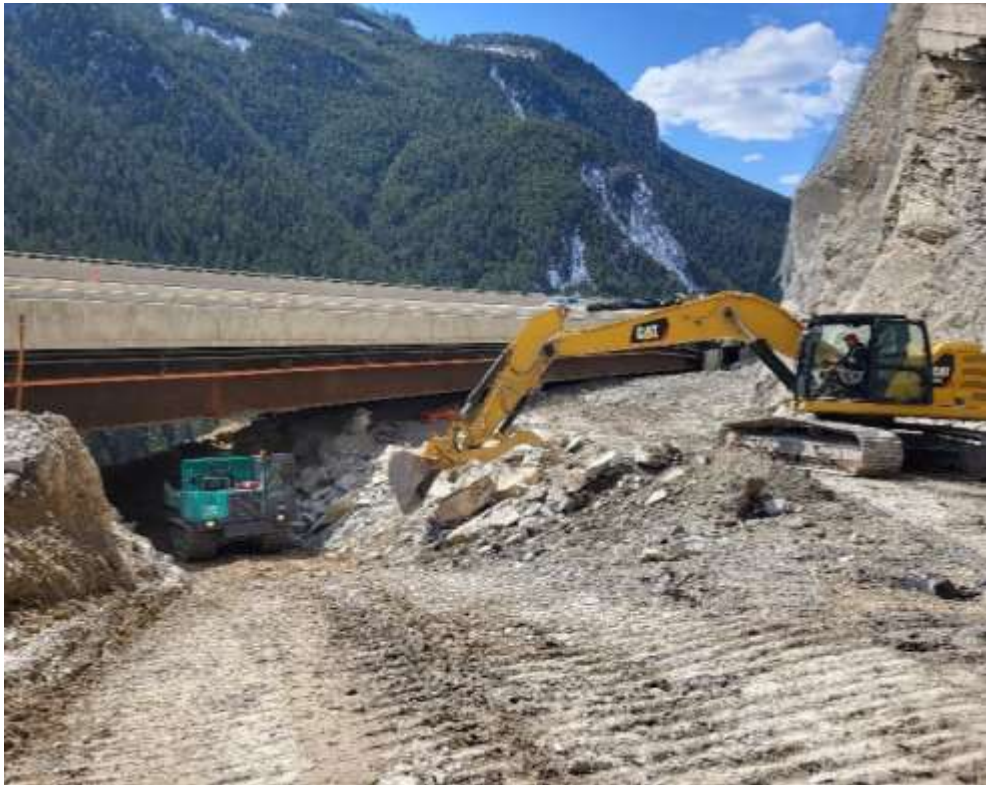
Figure 4: Access road pioneering at Frenchman's Bridge ongoing – April 18, 2024