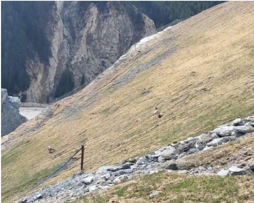
Figure 6: Bighorn sheep at Cut #3 – April 9, 2024