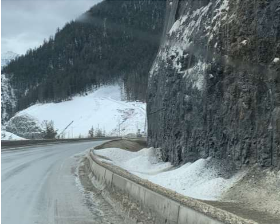
Figure 1: Snow accumulation in ditch along Grizzly Wall – March 2024