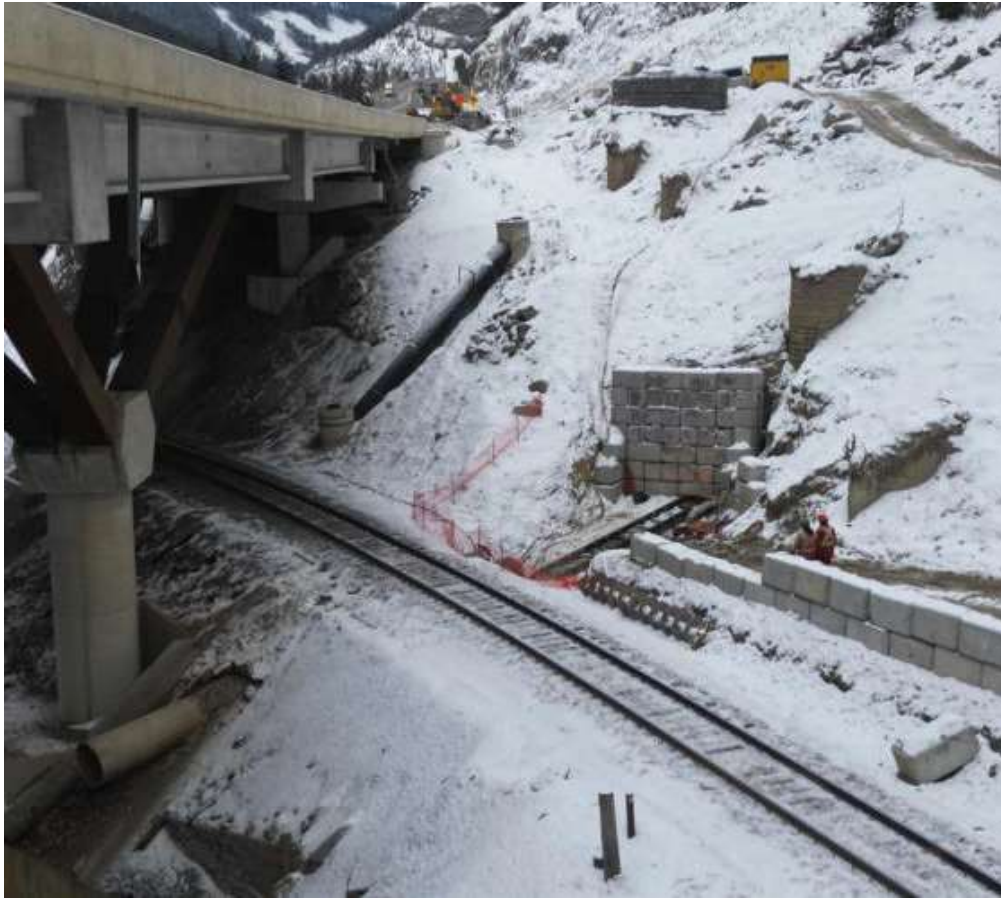
Figure 3: Caribou Viaduct – Storm water outfall pipe completed – December 12, 2023