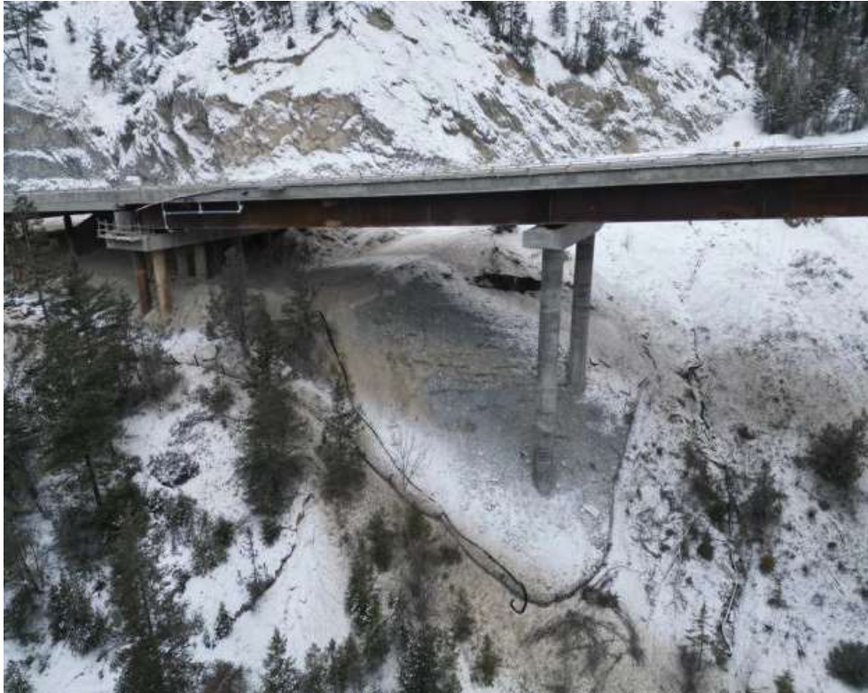
Figure 1: Bighorn Bridge – Deck drainage outfall pipe work completed – December 12, 2023