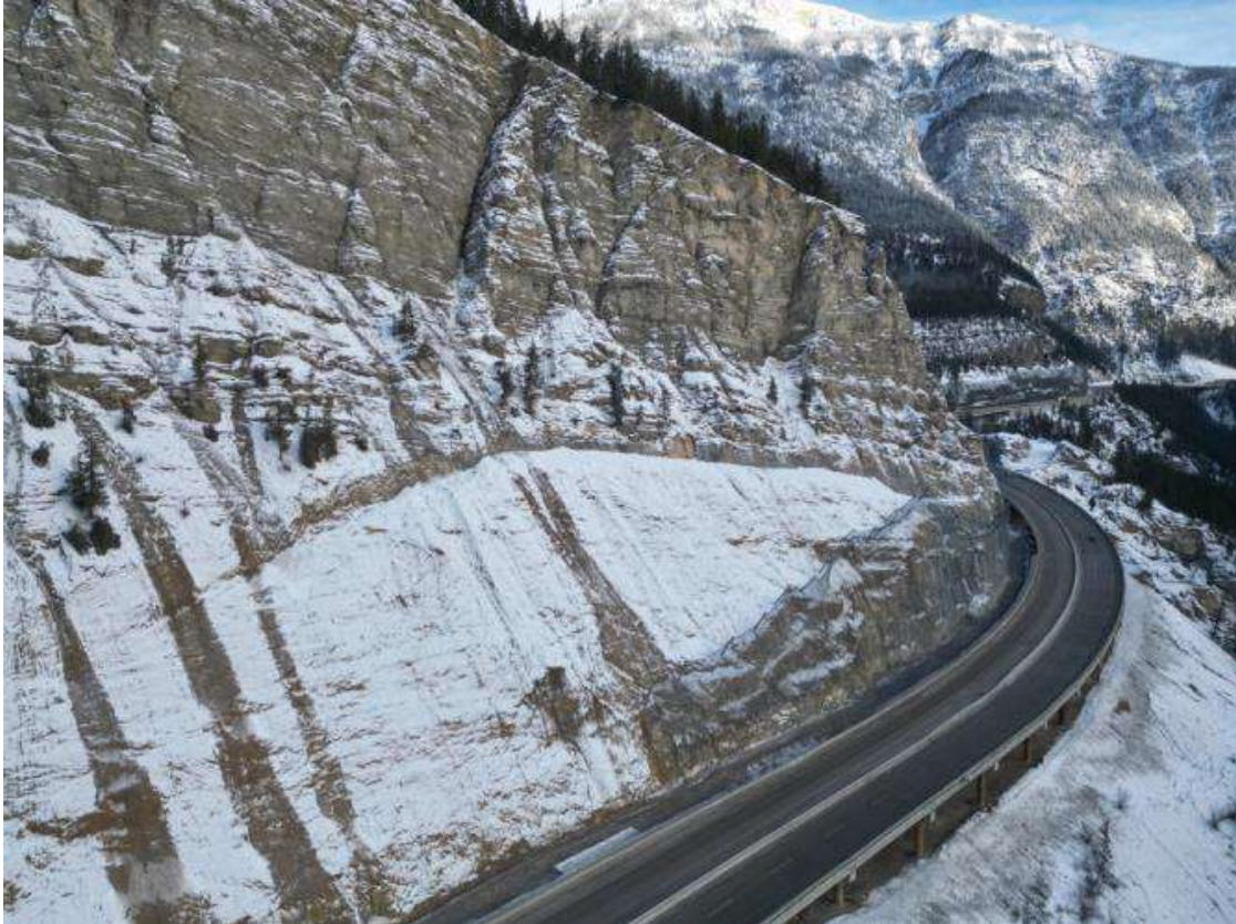
Figure 6: Cut 2 – West to east overview - December 8, 2023