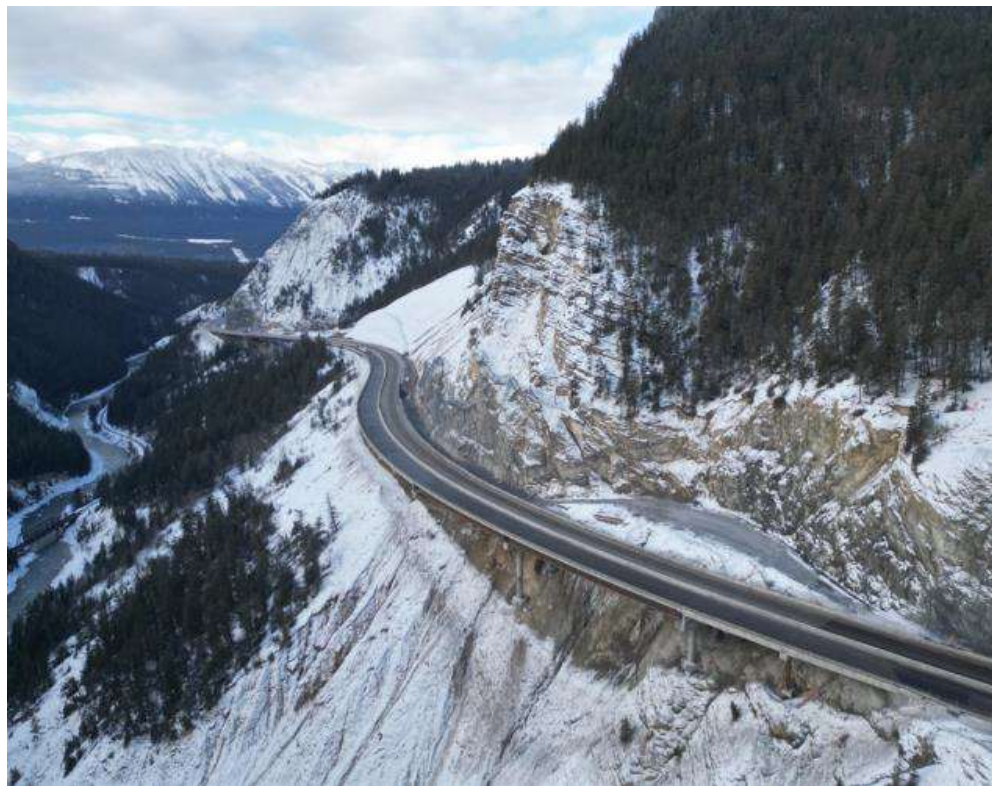
Figure 4: Frenchman's Viaduct – View looking west – December 8, 2023