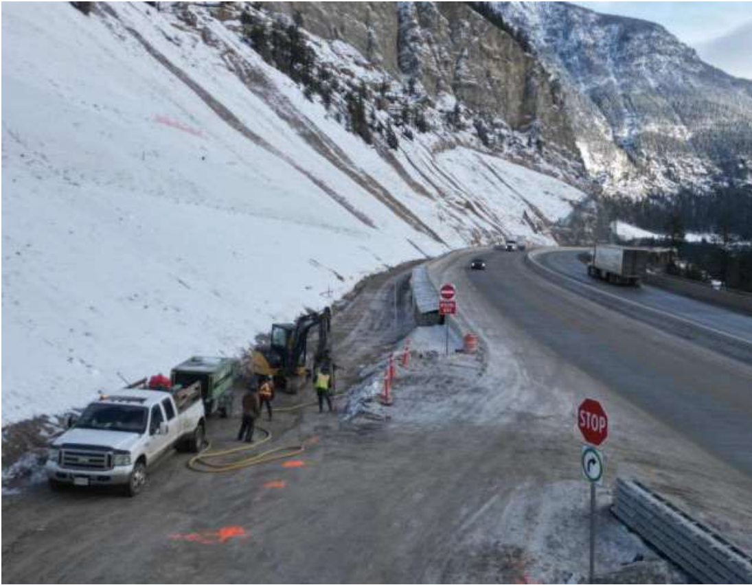
Figure 5: Lynx Viaduct – Wildlife fencing installation ongoing – December 8, 2023