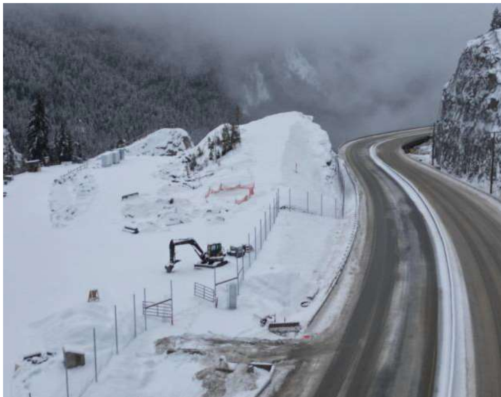
Figure 2: Cut 3 – Wildlife fencing installation ongoing – December 5, 2023