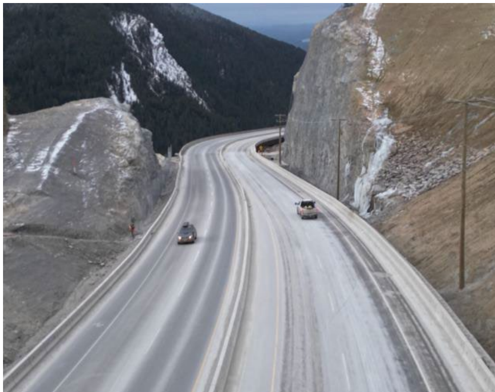
Figure 2: Cut 3 – 4 lanes open for traffic – November 30, 2023