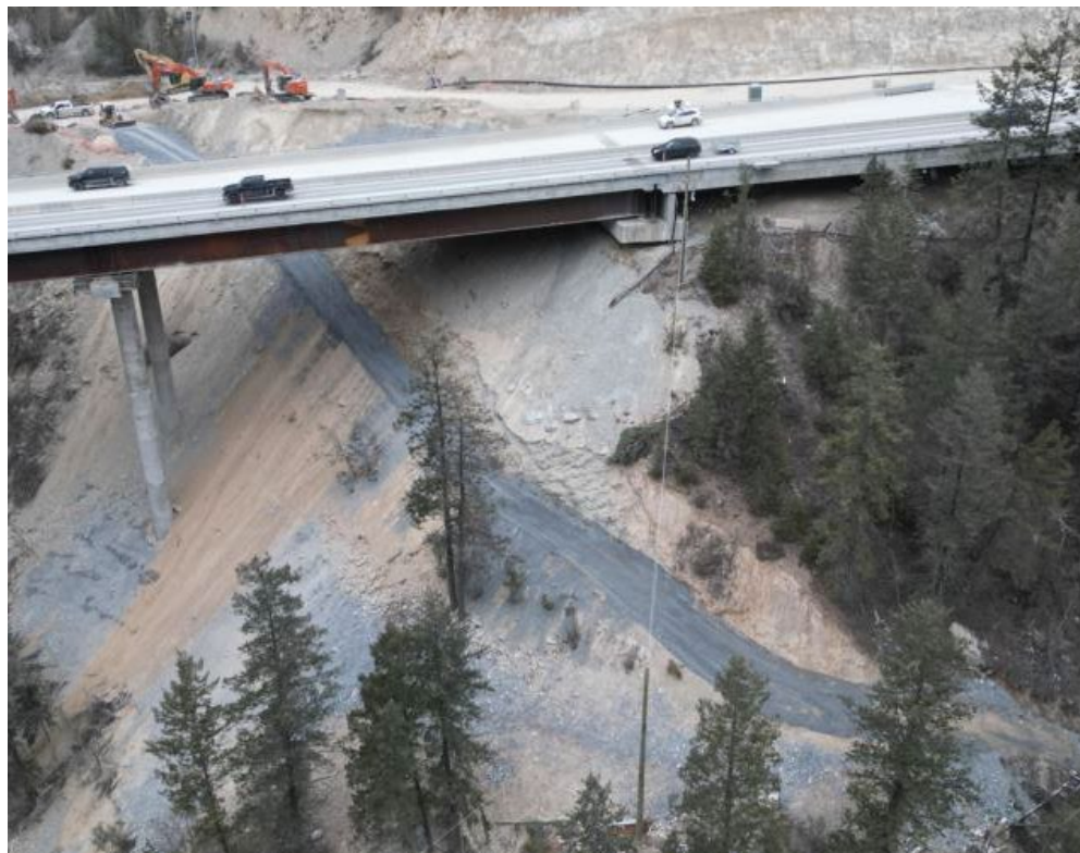
Figure 4: Bighorn Bridge – Access road underneath bridge completed – November 29, 2023