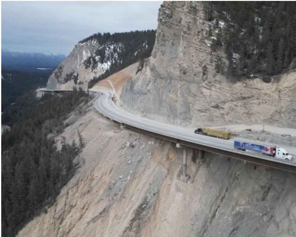
Figure 1: Frenchman's Viaduct – Four lanes open for traffic – November 30, 2023