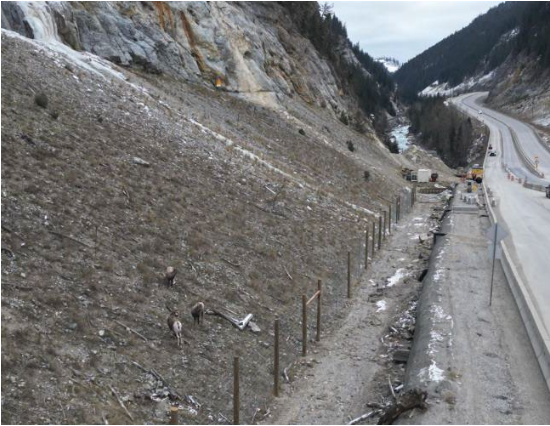
Figure 5: Caribou Hill – Wildlife fencing installation ongoing – November 28, 2023