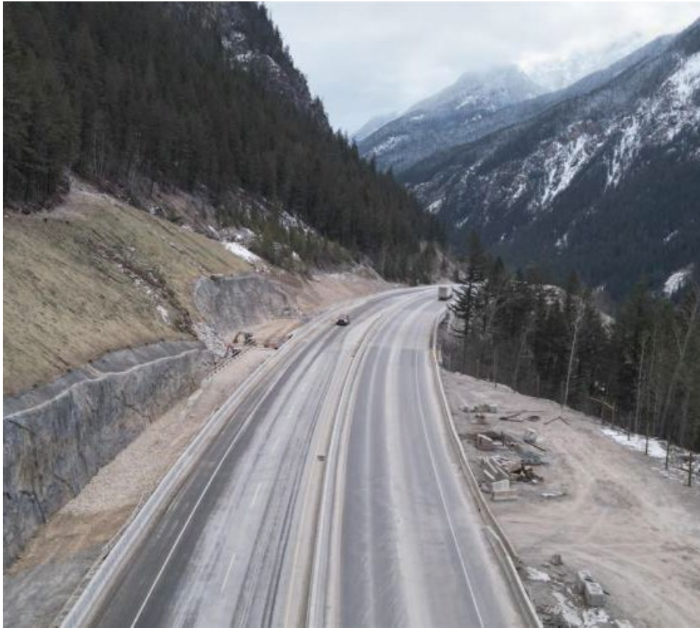
Figure 3: Marmot Viaduct – 4 lanes open for traffic – November 30, 2023