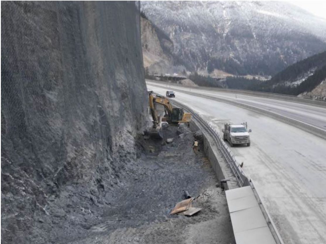
Figure 6: Sheep Bridge – Ditch work ongoing - November 28, 2023