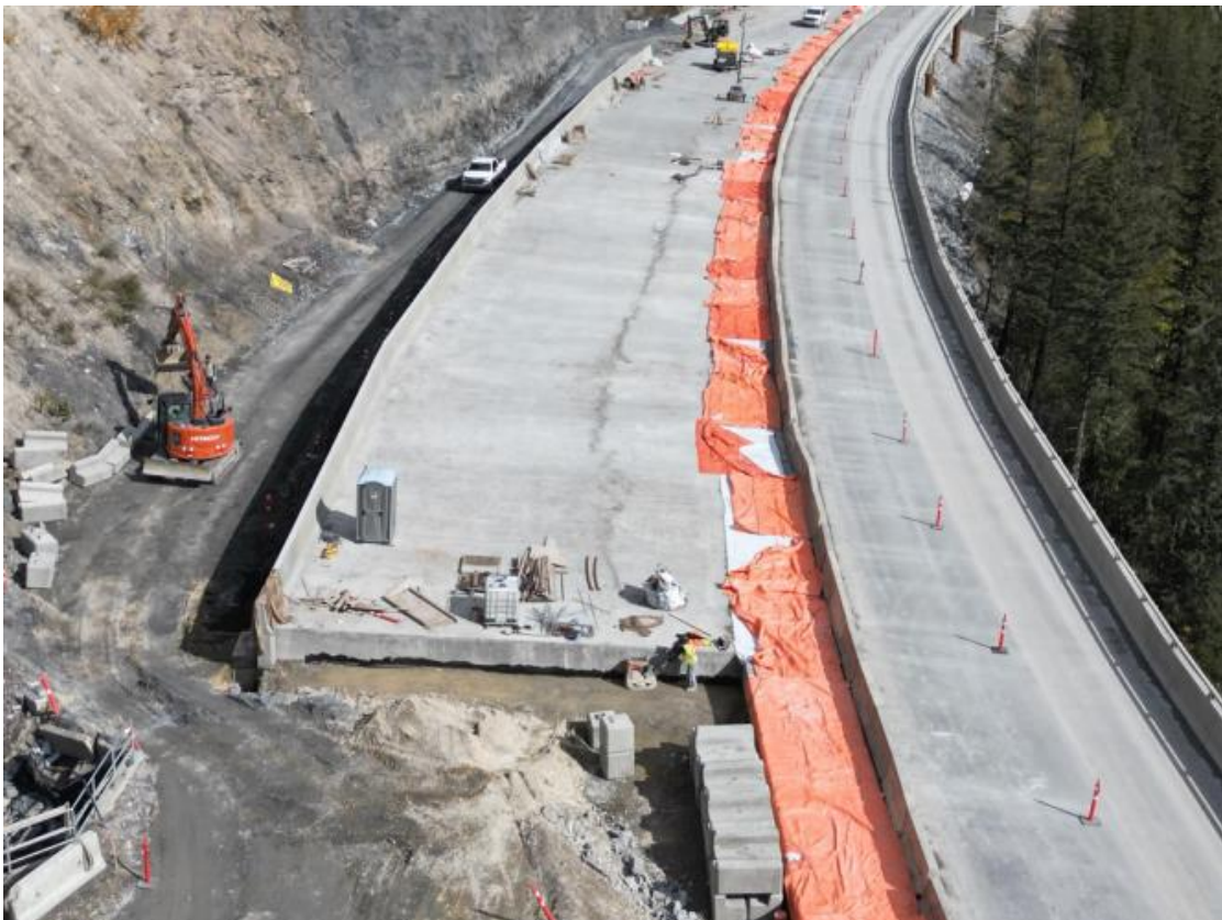
Figure 6: Elk Viaduct – West abutment and avalanche wall construction ongoing –September 29, 2023 Kicking Horse Canyon Phase 4