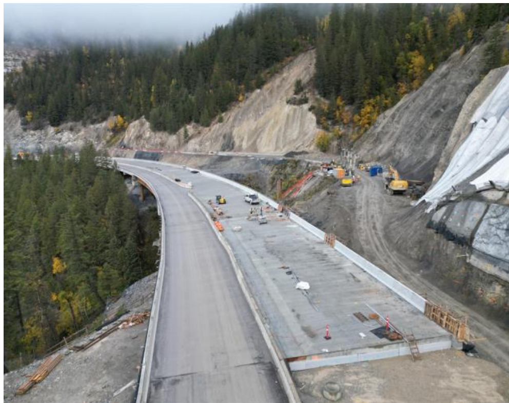
Figure 4: Hedgehog Viaduct – Parapet infill forming in progress – September 30, 2023