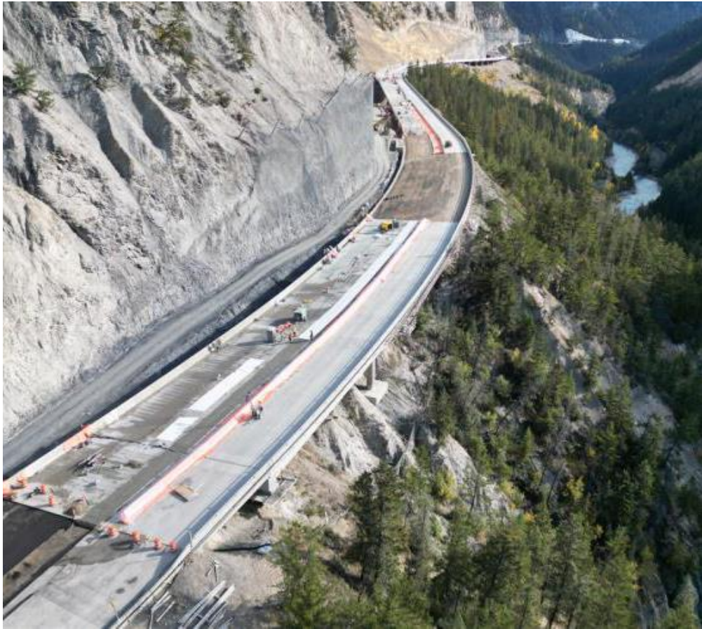
Figure 3: Sheep Bridge – Deck curing ongoing – September 29, 2023