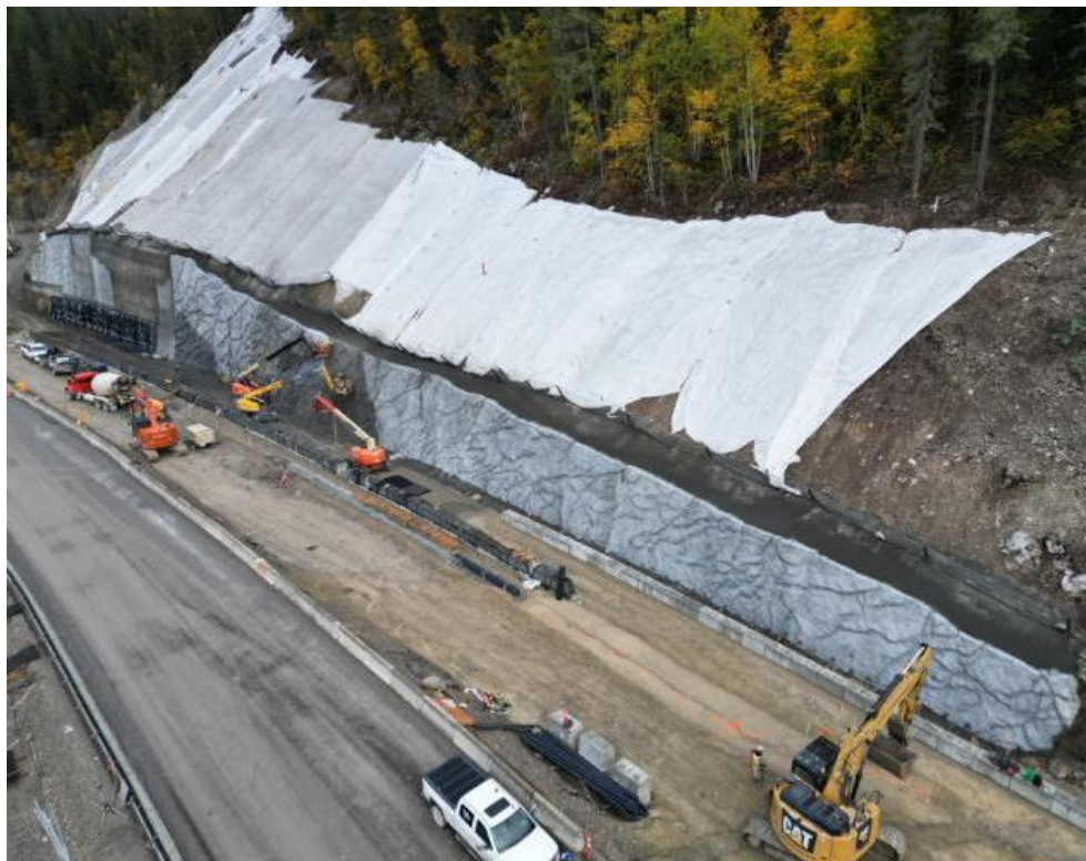
Figure 2: Bison Upslope Wall – Architectural wall finishing ongoing – September 30, 2023