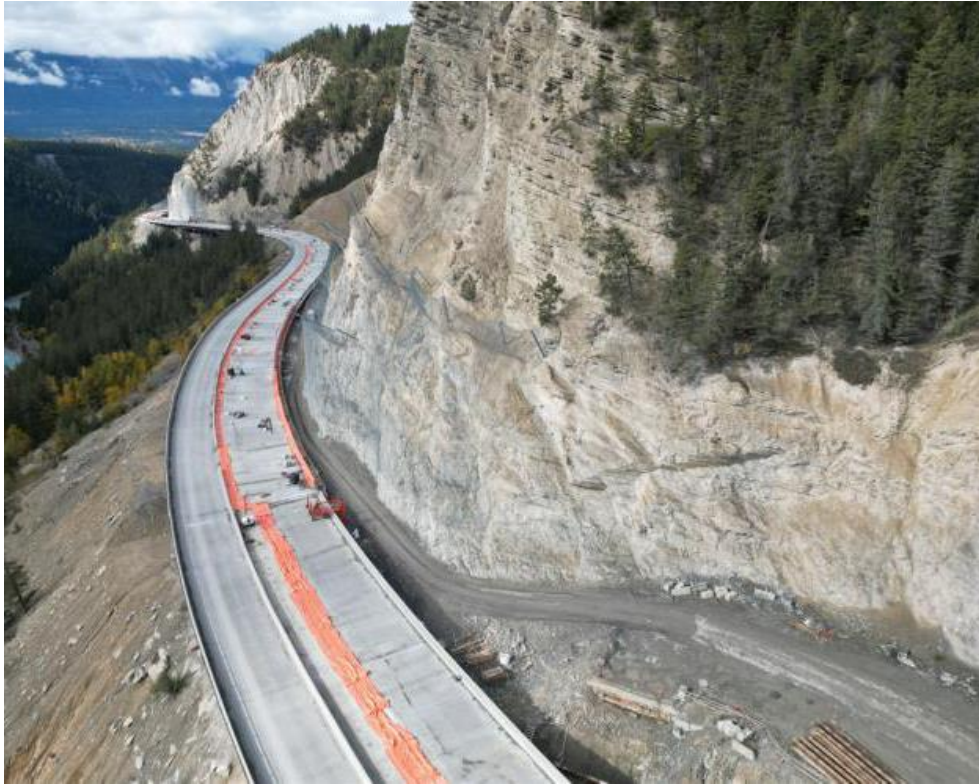
Figure 1: Lynx Viaduct – Deck curing ongoing – September 29, 2023