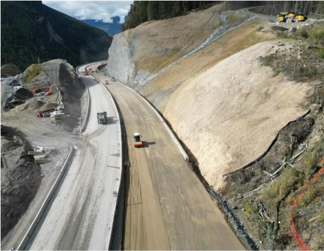
Figure 5: Cut 3 – Road base grading and compaction ongoing – September 29, 2023