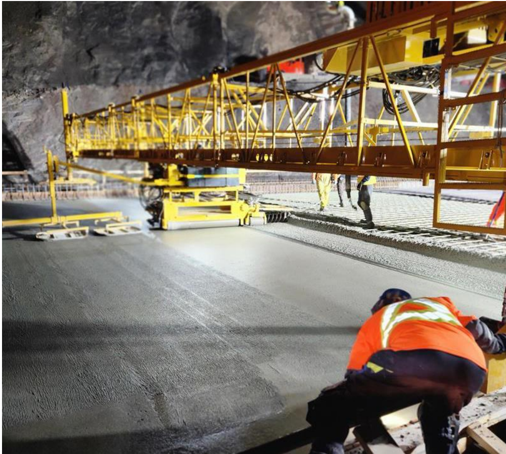
Figure 3: Grizzly Viaduct – Nighttime concrete deck pour – May 30, 2023