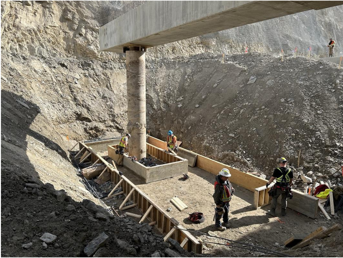
Figure 5: Lynx Viaduct – Footing formwork in progress for pier retaining wall – May 30, 2023