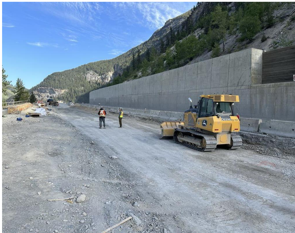
Figure 4: Caribou Viaduct/Wall – Grading on west side in progress – May 31, 2023