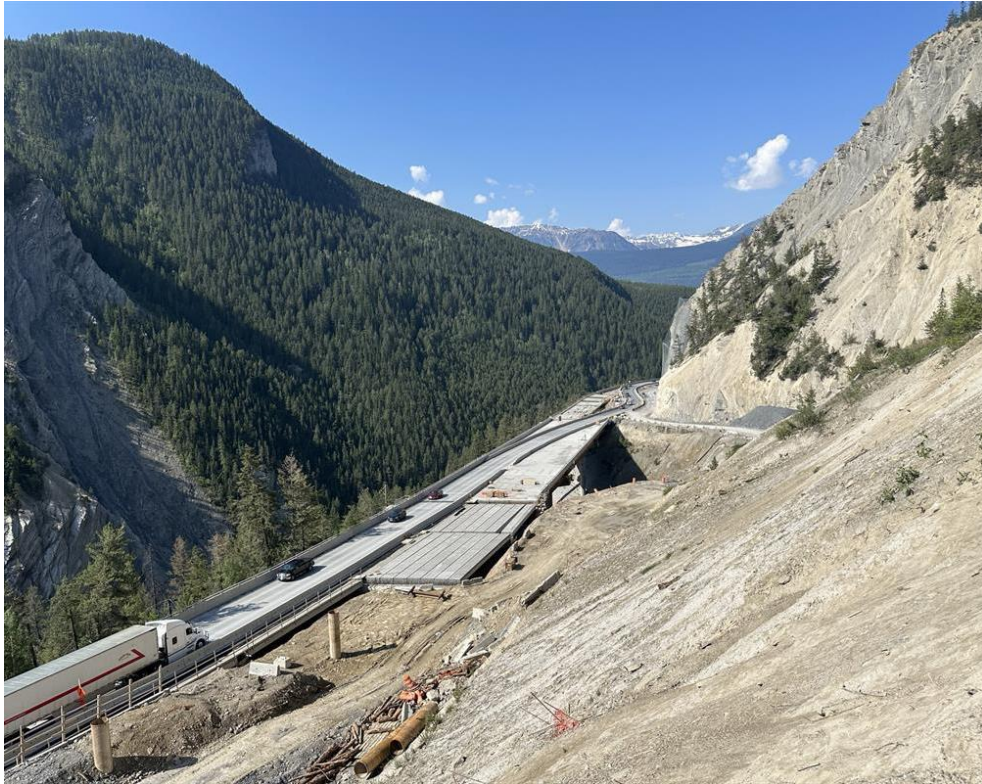
Figure 1: Pronghorn Upslope – View looking west from Pronghorn Upslope bench – May 27, 2023