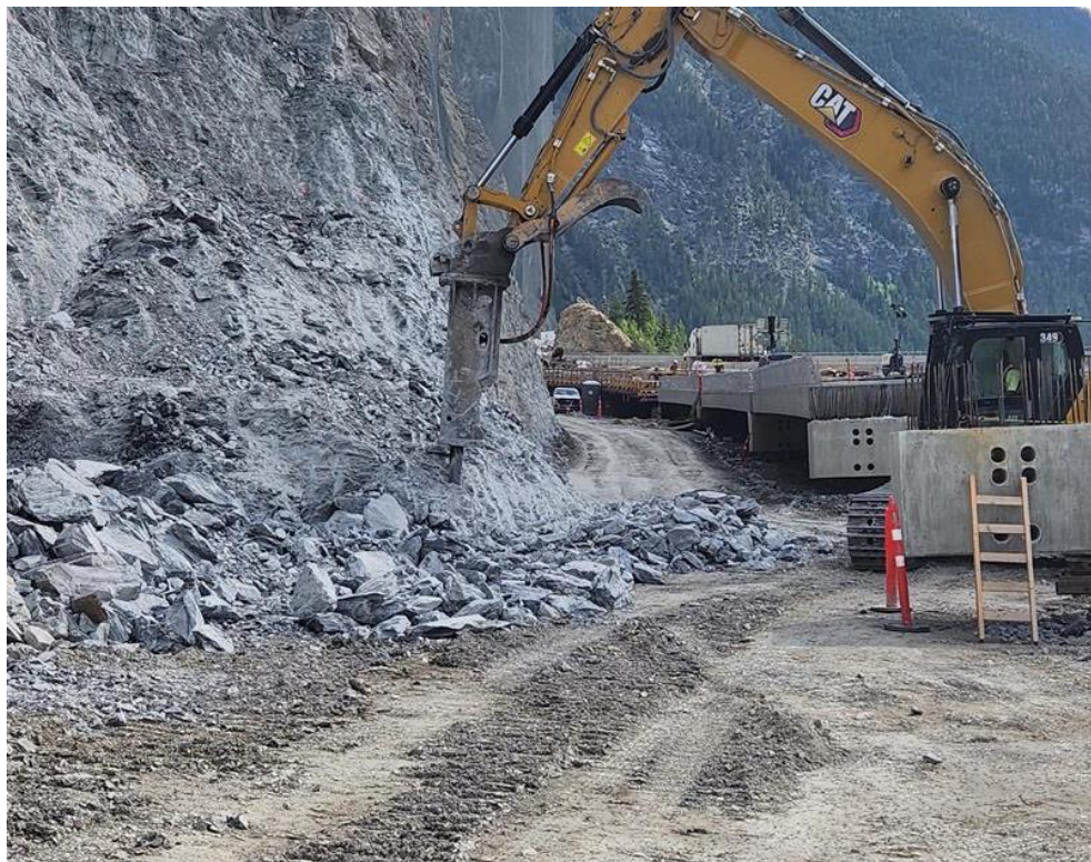
Figure 2: Cut 2 – Mechanical rock removal along shear line – May 31, 2023