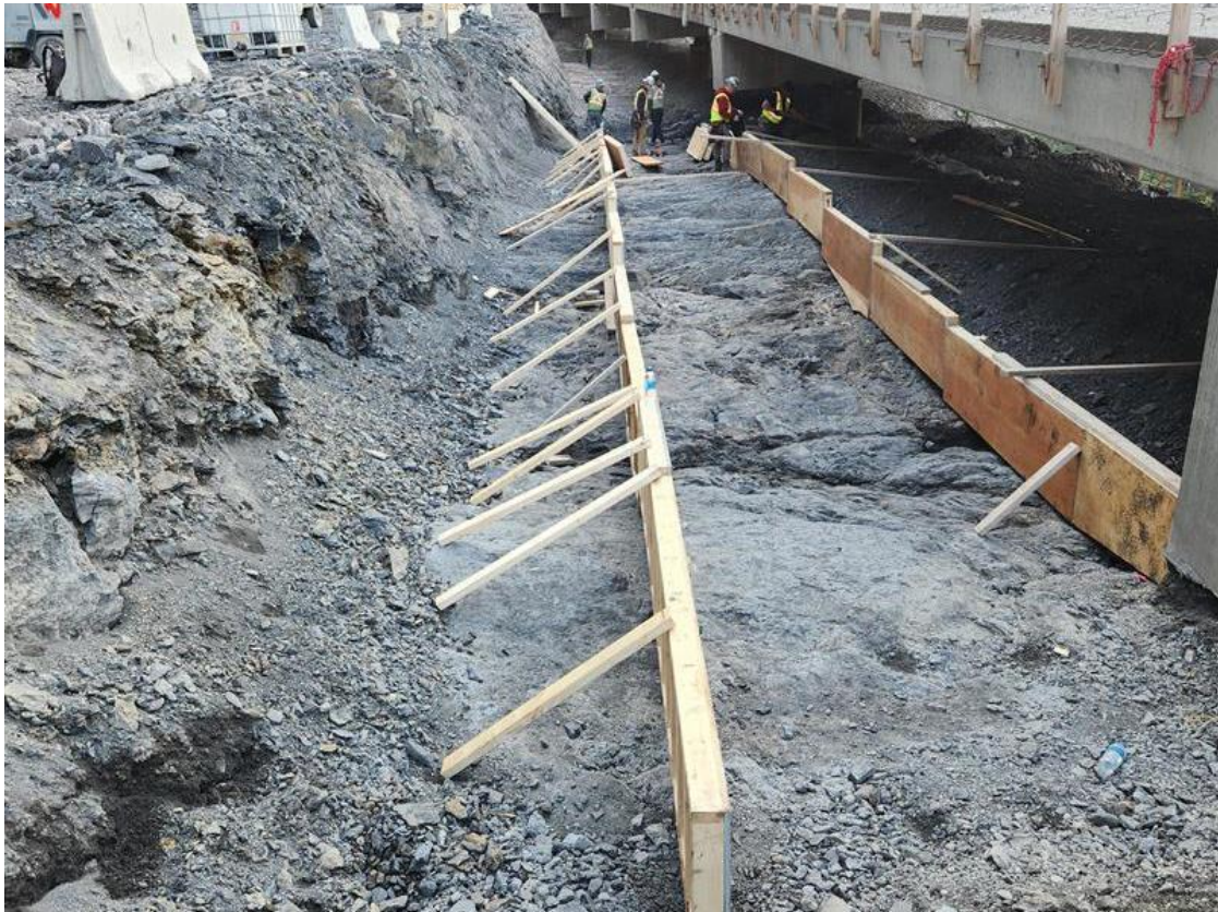
Figure 6: Wolf Viaduct – Carpenters installing median wall foundation formwork – May 31, 2023