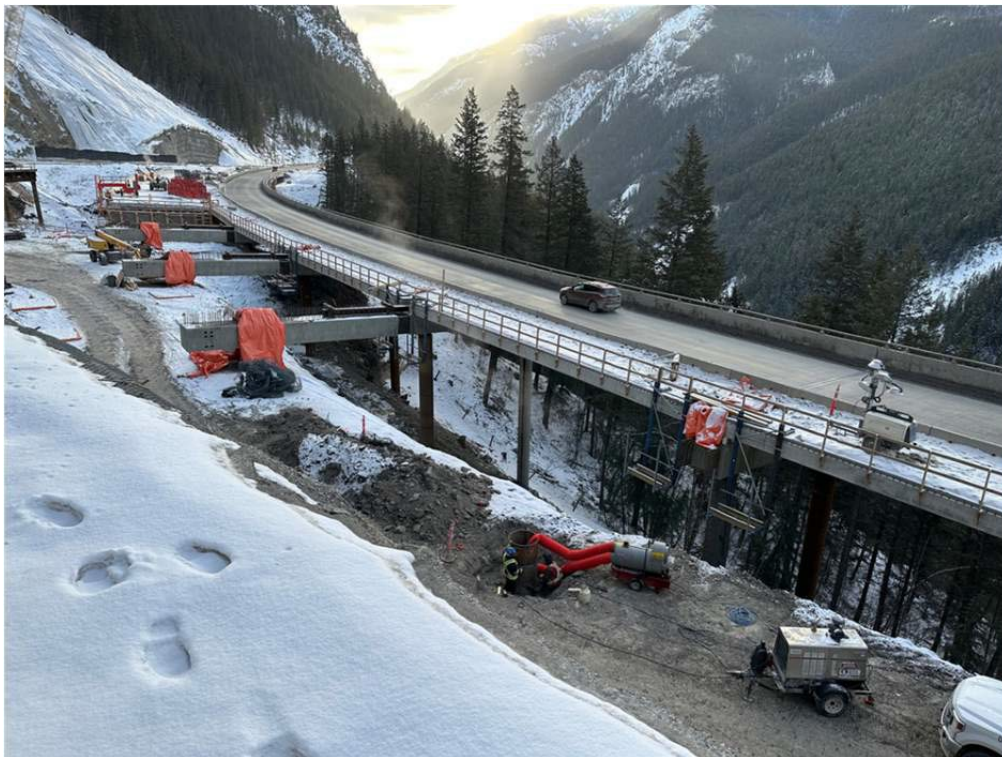
Figure 4: Grizzly Viaduct – Preparation for drift link installation ongoing – January 30, 2023