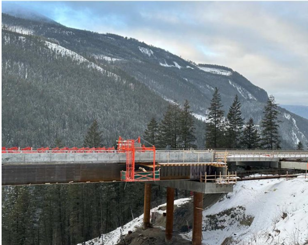
Figure 1: Blackwall Bridge - Overhang formwork removal ongoing – January 30, 2023