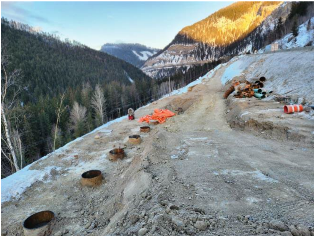
Figure 6: Caribou Wall - Stability piling complete – January 21, 2023