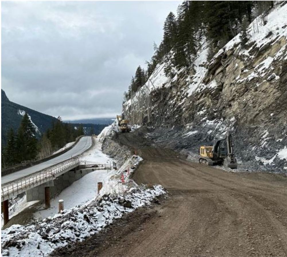
Figure 3: Cut 4 – Crews continue to excavate and haul material to disposal site – January 10, 2023