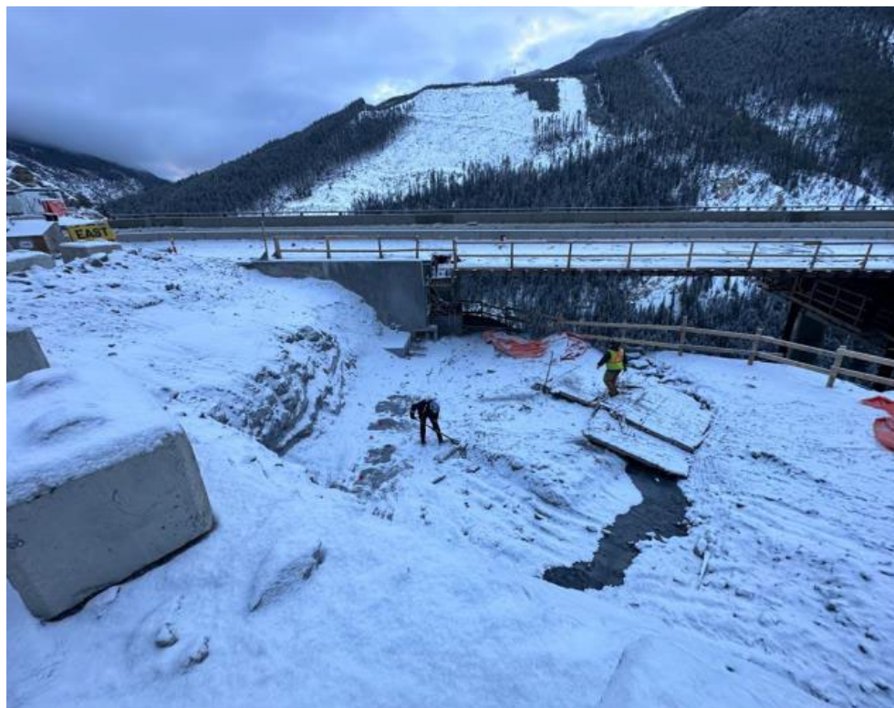
Figure 2: Frenchman's Viaduct - Formwork installation for footings ongoing – January 27, 2023