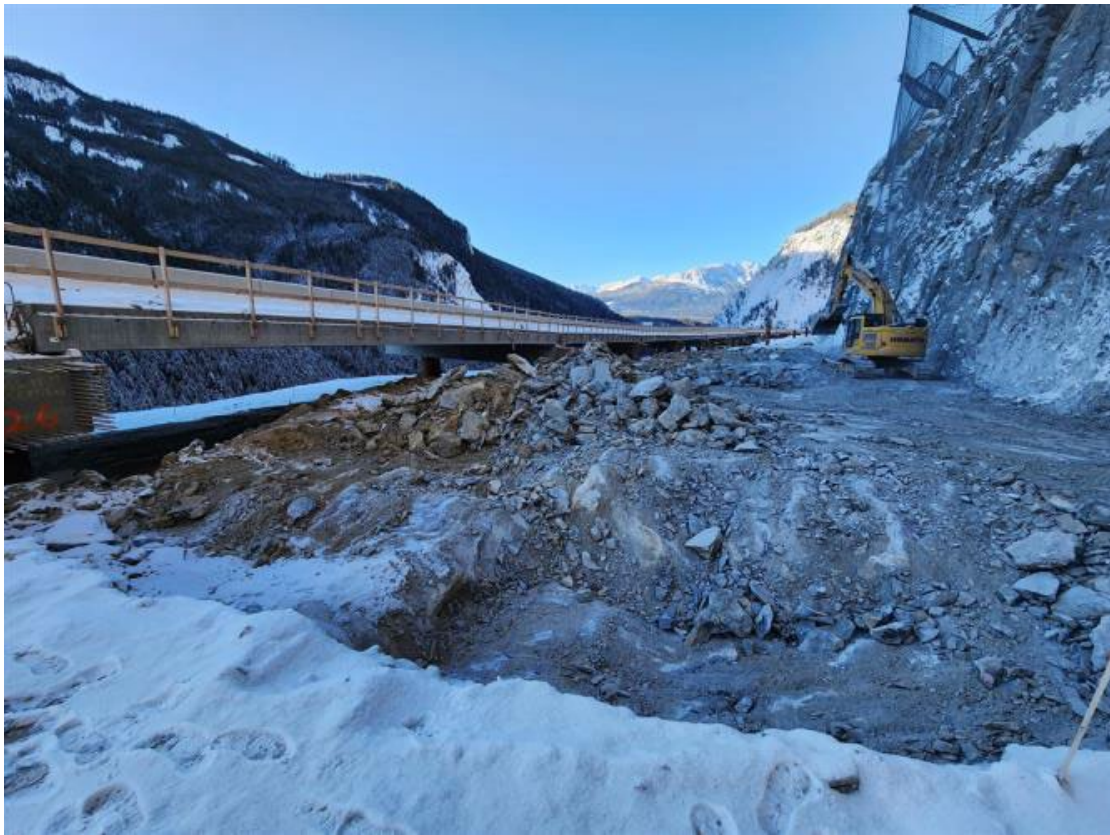
Figure 5: Lynx Viaduct – Excess material removal under sub-caps – January 28, 2023