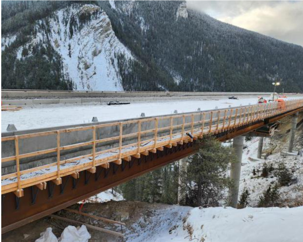
Figure 1: Bighorn Bridge – Installation of parapet wall railing – December 17, 2022