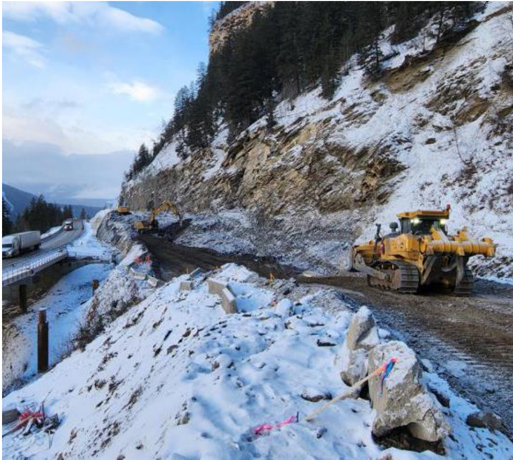
Figure 3: Cut 4 – Dozer pushing road through – December 17, 2022