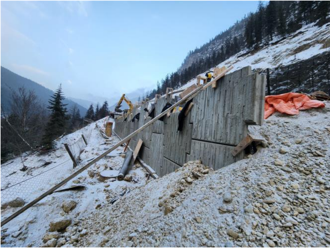
Figure 5: Caribou Viaduct – MSE wall east approach – December 17, 2022