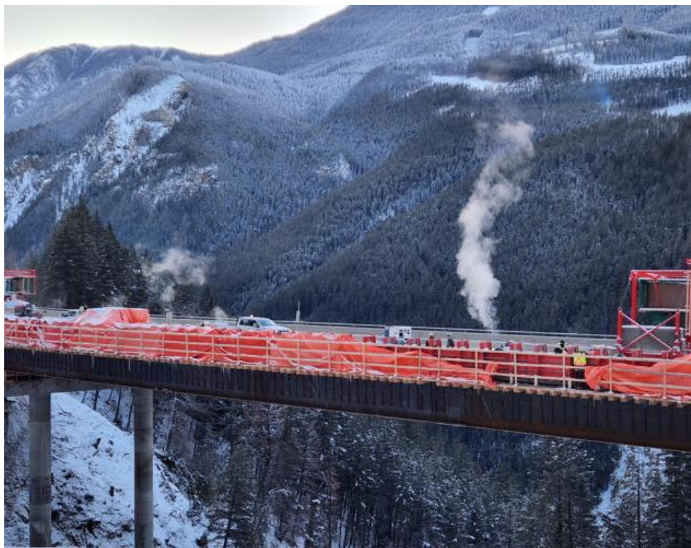
Figure 2: Blackwall Bridge - Stripping parapet wall formwork – December 19, 2022