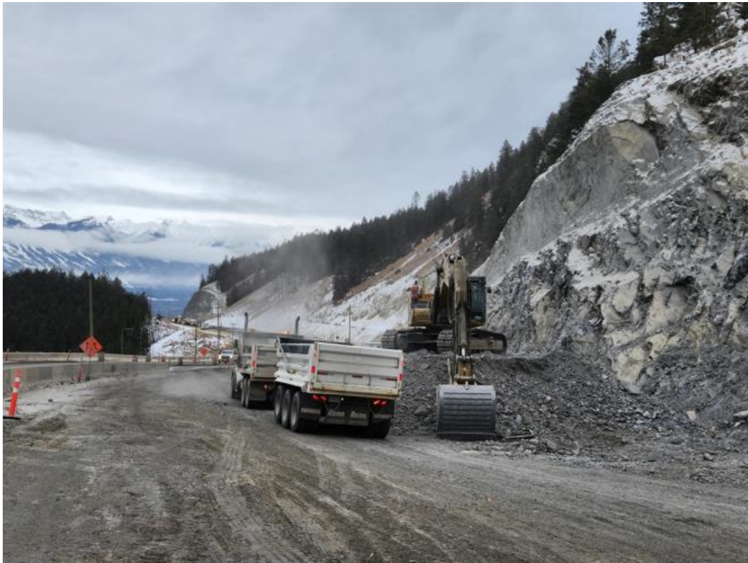
Figure 6: Cut 1 – Material haul away from west end – December 16, 2022