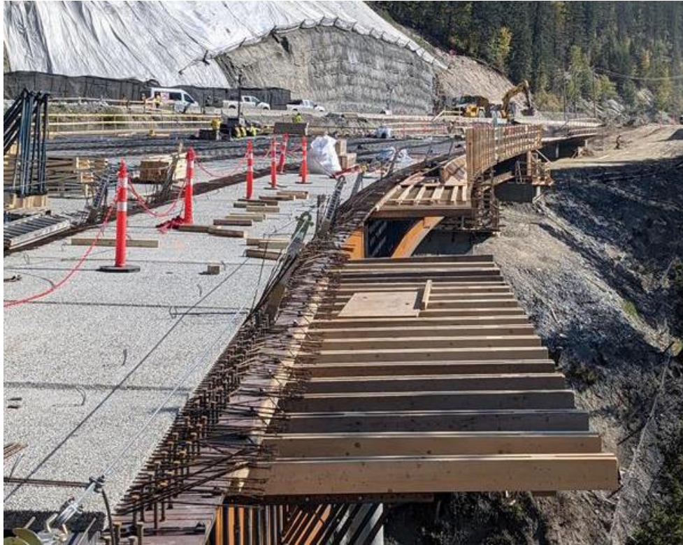
Figure 1: Blackwall Bridge – Overhang brackets and formwork installation – September 30, 2022