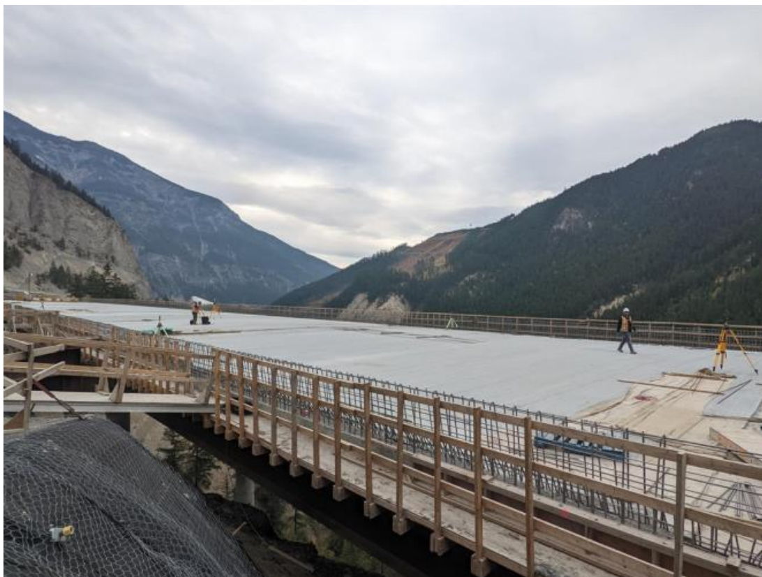
Figure 6: Bighorn Bridge – Bridge survey in progress – September 29, 2022