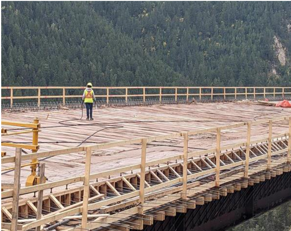
Figure 2: Frenchman's Bridge – Wet curing of deck surface – September 29, 2022