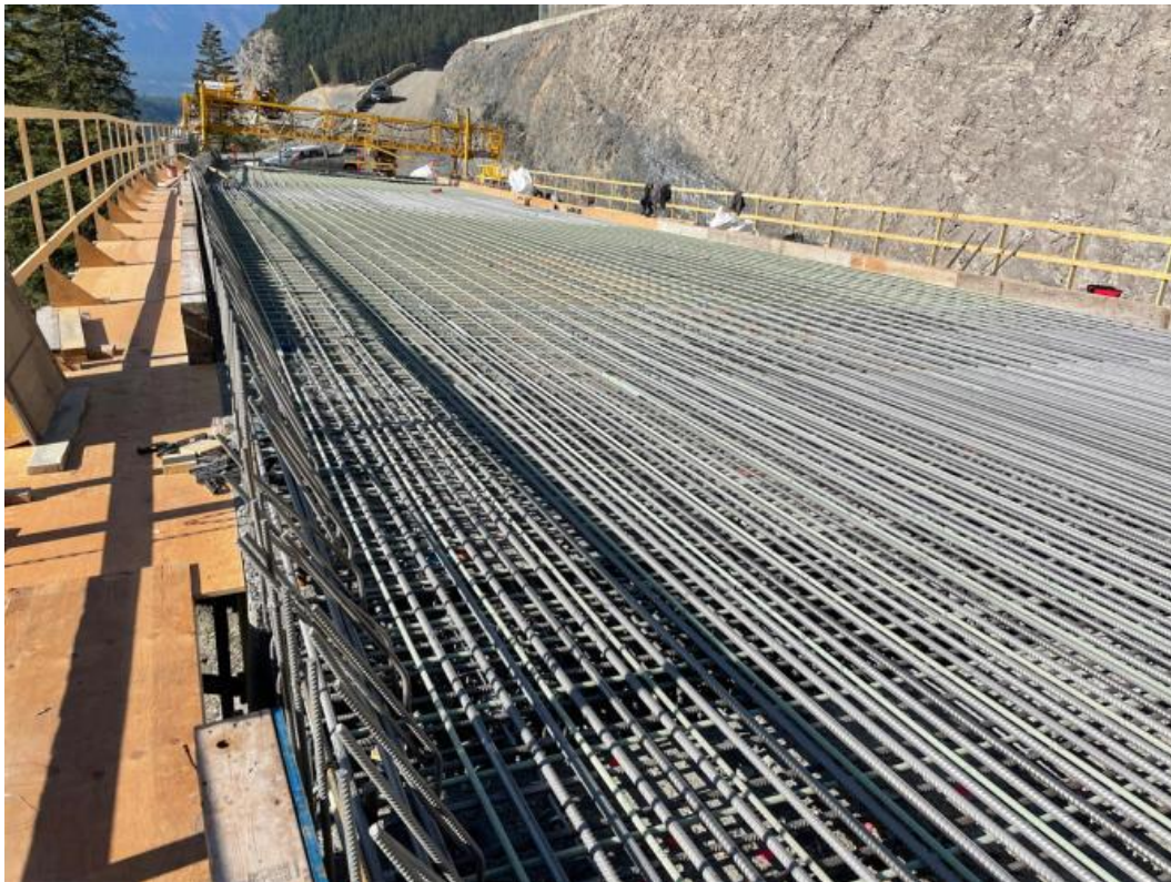
Figure 3: Wolf Viaduct – First 3 spans ready for deck pour – September 30, 2022