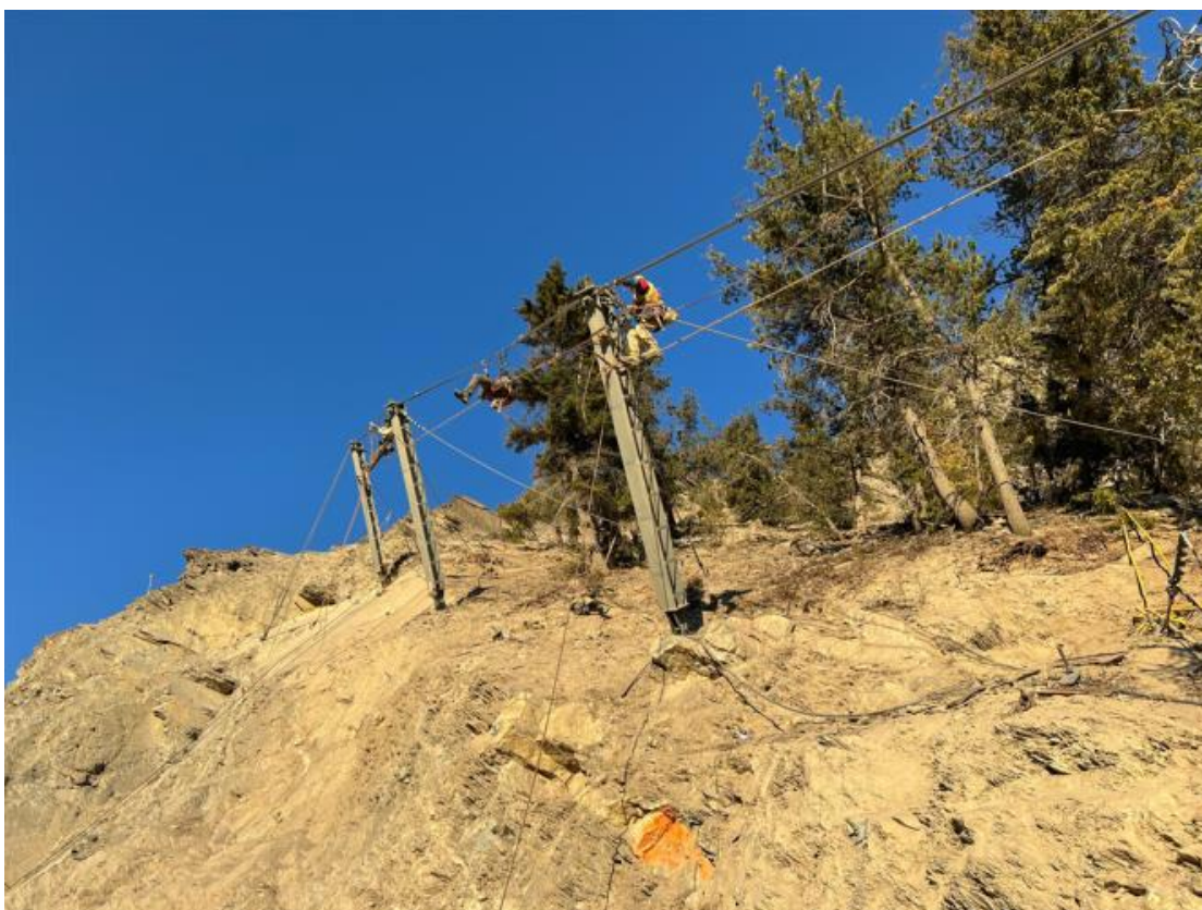
Figure 5: Cut 1 - Installing attenuator fences – September 30 2022