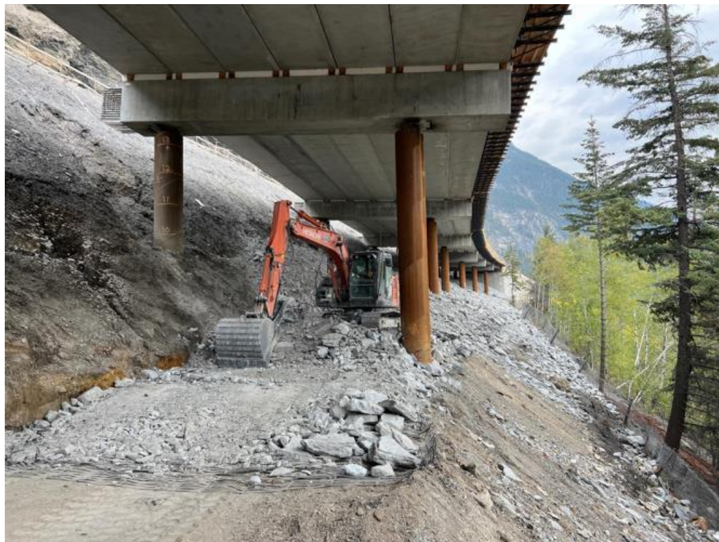
Figure 4: Elk Viaduct – Backfilling and compacting – September 29, 2022