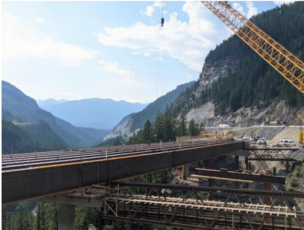
Figure 1: Blackwall Bridge – Cross-bracing installation ongoing – August 31, 2022