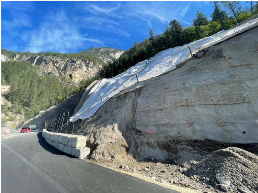
Figure 4: Bison Upslope Wall – CRB barrier installed along road shoulder – August 30, 2022