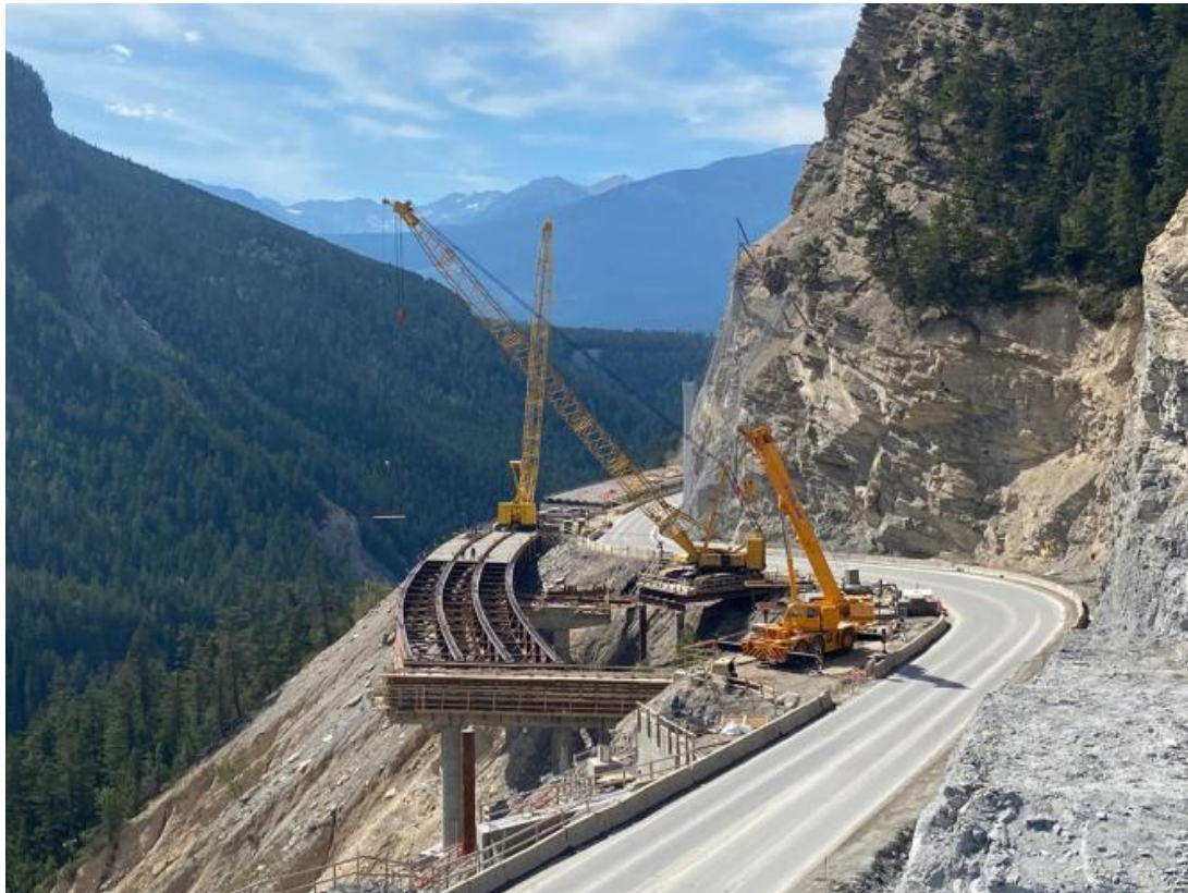
Figure 6: Frenchman's Bridge – Looking west at deck panel installation – August 30, 2022