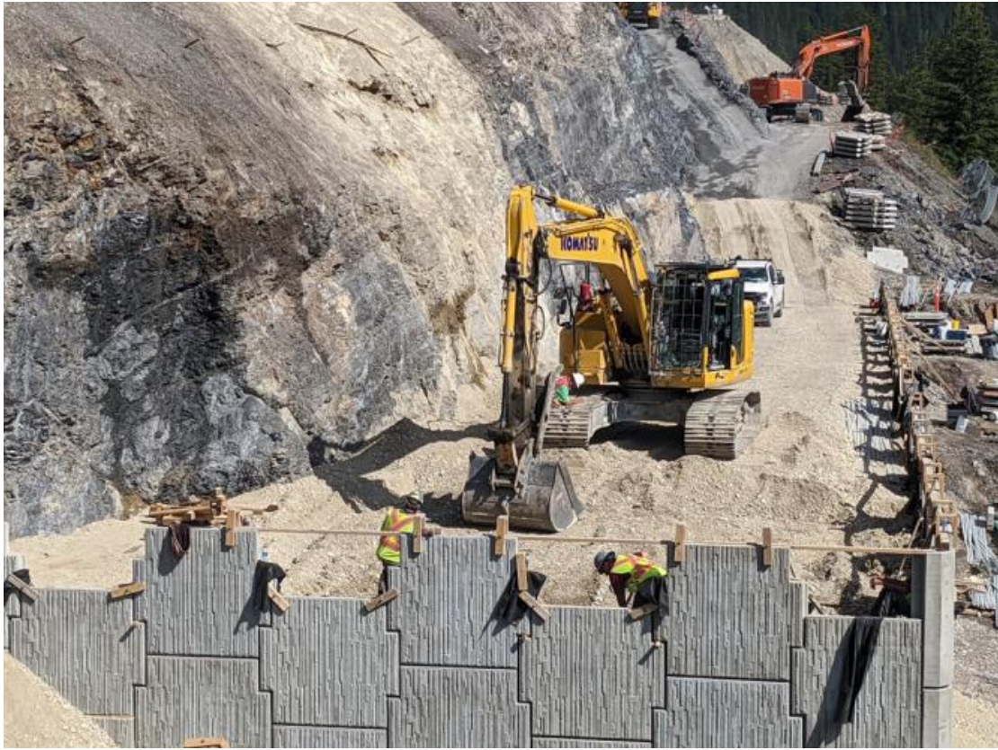
Figure 5: Grizzly Wall 2 – Crews installing MSE wall panels – August 30 2022