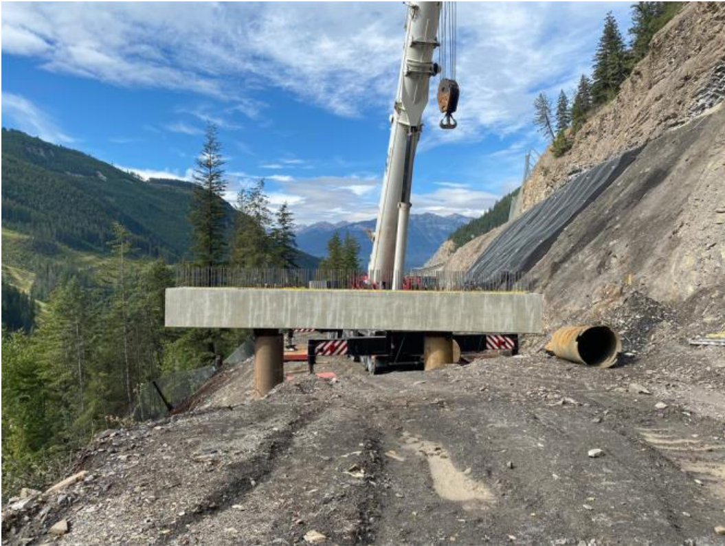
Figure 3: Wolf Viaduct – Pier cap installation in progress – August 29, 2022