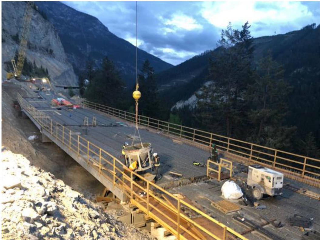
Figure 4: Lynx Viaduct– Pouring concrete keyway's at Span 2 – May 27, 2022