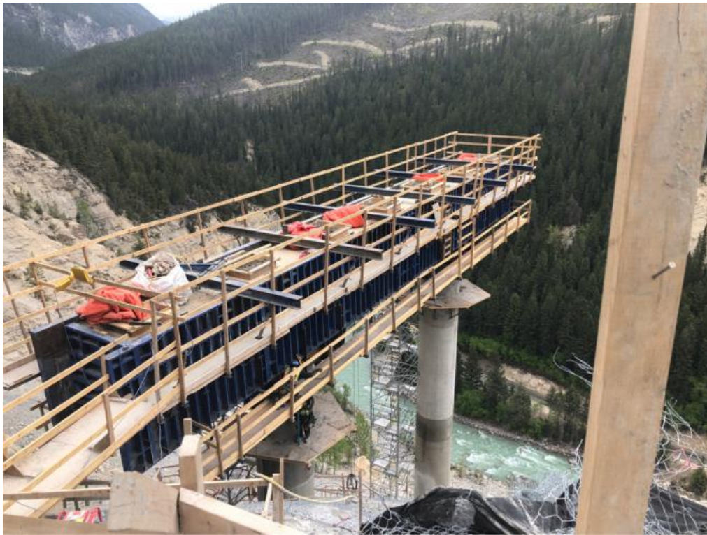
Figure 5: Frenchman's Bridge – Center pier cap formwork – May 25, 2022