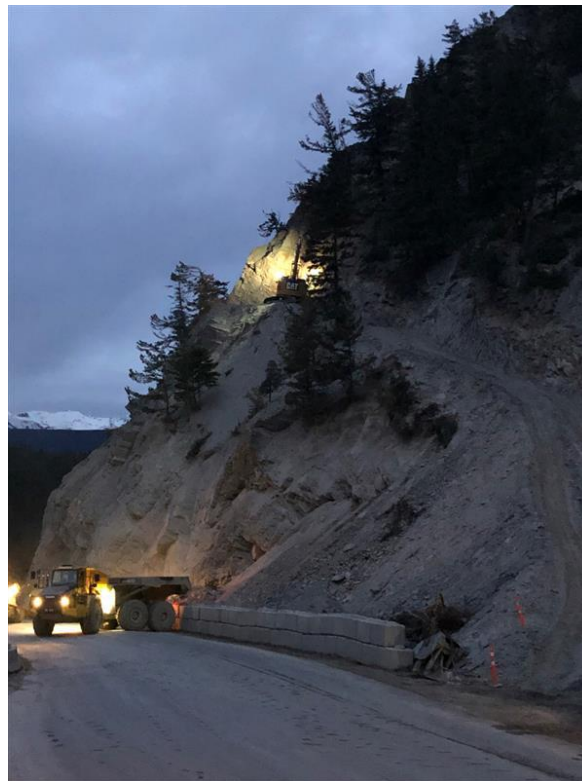
Figure 6: Cut 1 – Pioneering work continues at east end of Cut 1 – May 30, 2022