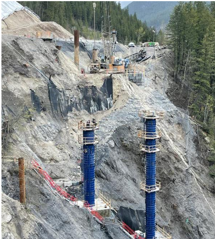
Figure 2: Blackwall Bridge – Pouring concrete for pier column – May 13, 2022