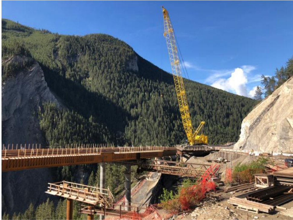
Figure 1: Bighorn Bridge – Cross-bracing installation in progress – May 28, 2022