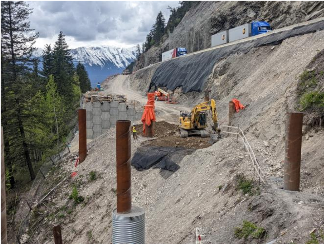
Figure 3: Grizzly Viaduct – Crane pads installation ongoing – May 25, 2022