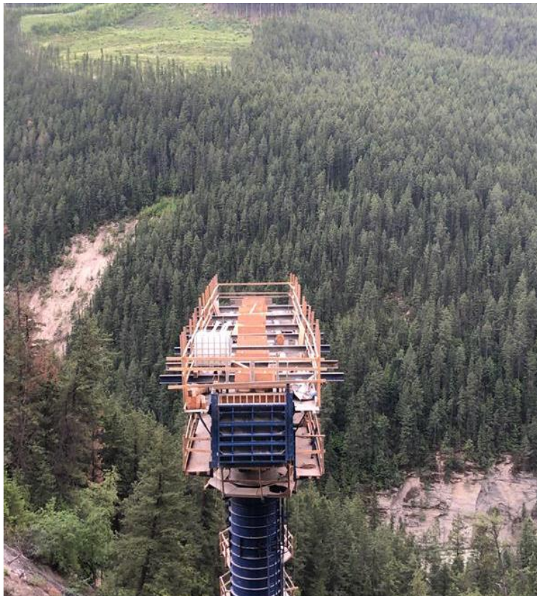
Figure 2: Blackwall Bridge – Bearing pad formwork installation in progress – June 28, 2022