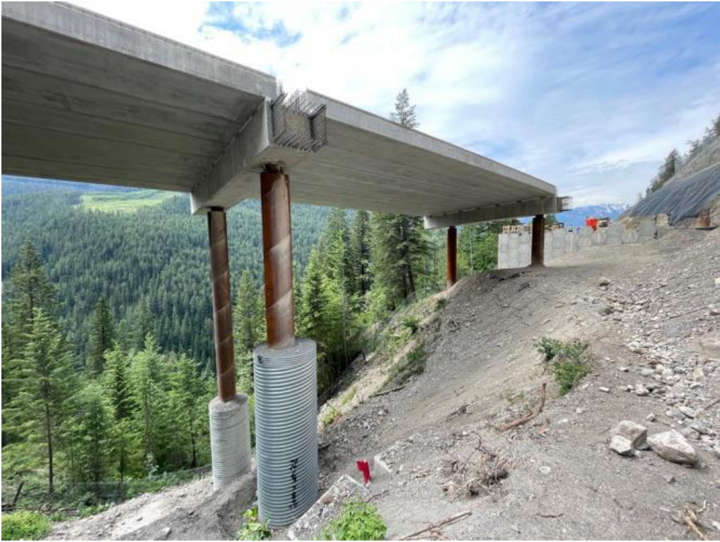
Figure 5: Grizzly Viaduct – Underside of bridge – June 28, 2022