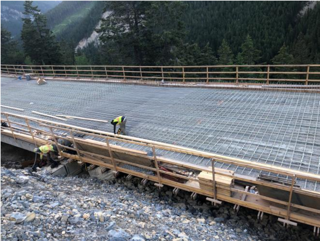
Figure 3: Lynx Viaduct – Formwork installation for edge of deck ongoing – June 30, 2022