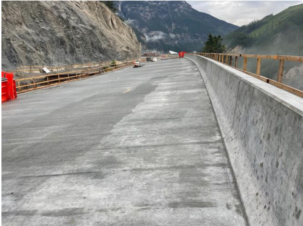
Figure 4: Sheep Bridge – East bound wall complete – June 29, 2022