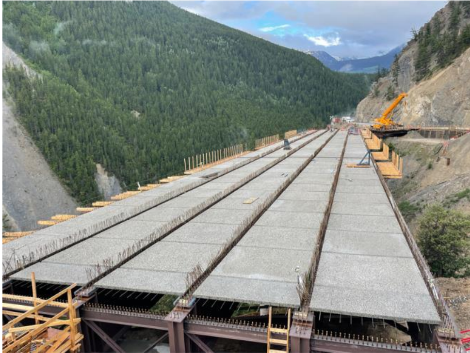
Figure 1: Bighorn Bridge – Overhanging bracket installation ongoing – June 29, 2022