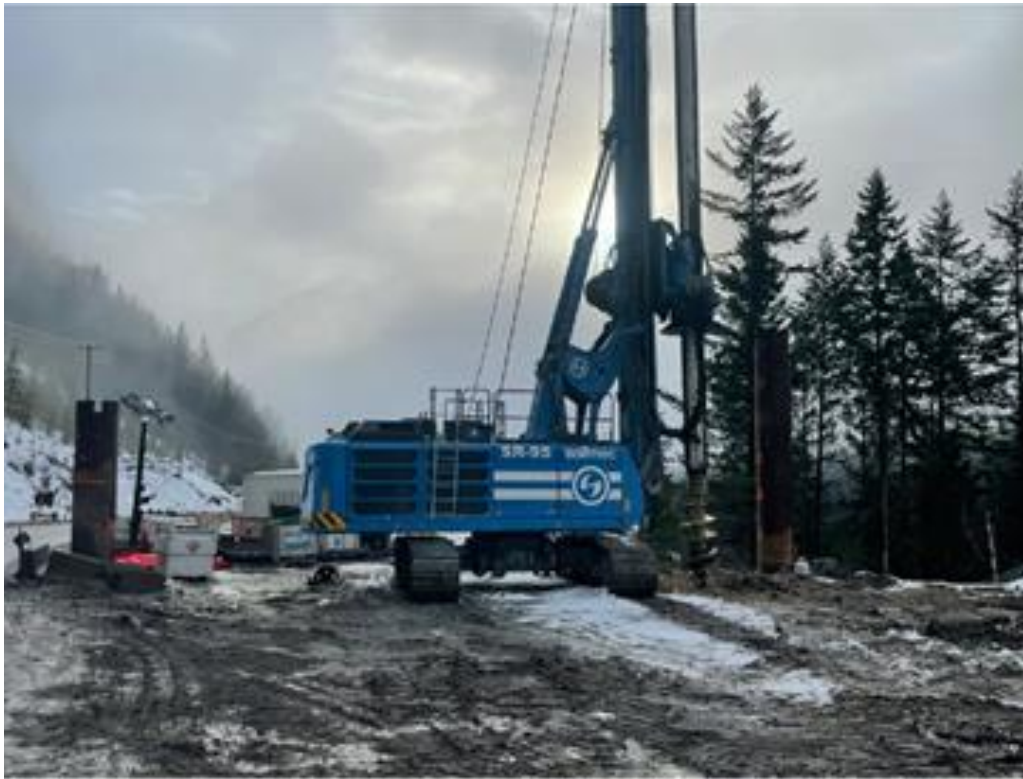
Figure 6: Marmot – SR40 piling at marmot with Basis Engineering performing checks – Nov 30, 2021