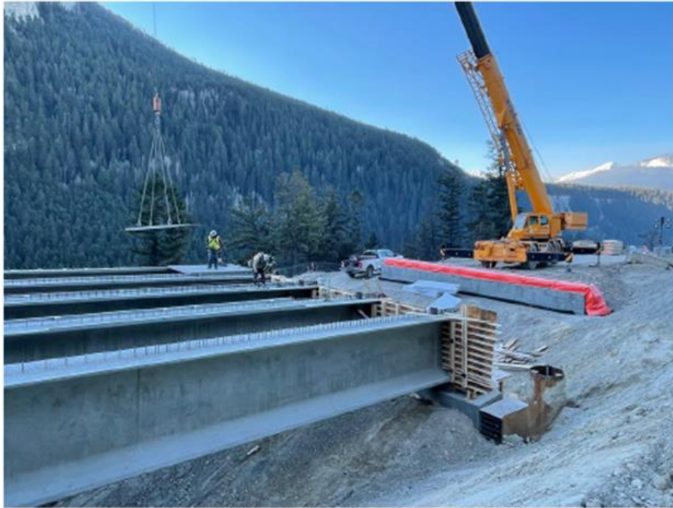
Figure 1: Sheep's Bridge – Installing 90mm thick precast deck panels – Nov 1, 2021