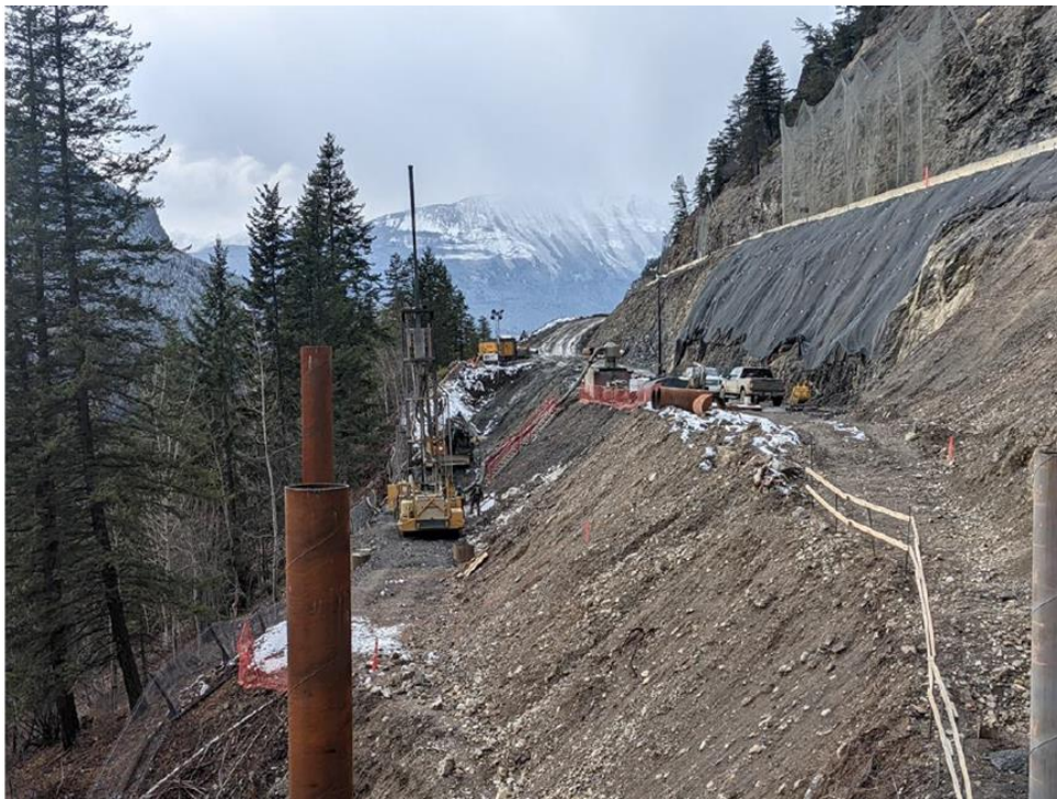
Figure 2: Grizzly 4 – Crews installing piles – Nov 8, 2021