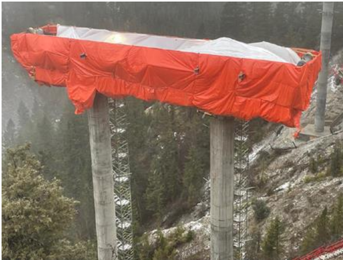
Figure 4: Bighorn Bridge – Heat and hoarding pier cap during curing process – Nov 13, 2021