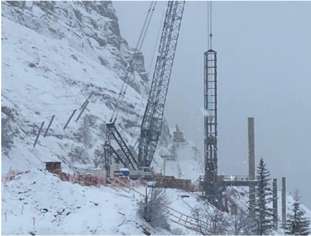
Figure 5: Lynx Viaduct crews installing piles – Nov 25, 2021