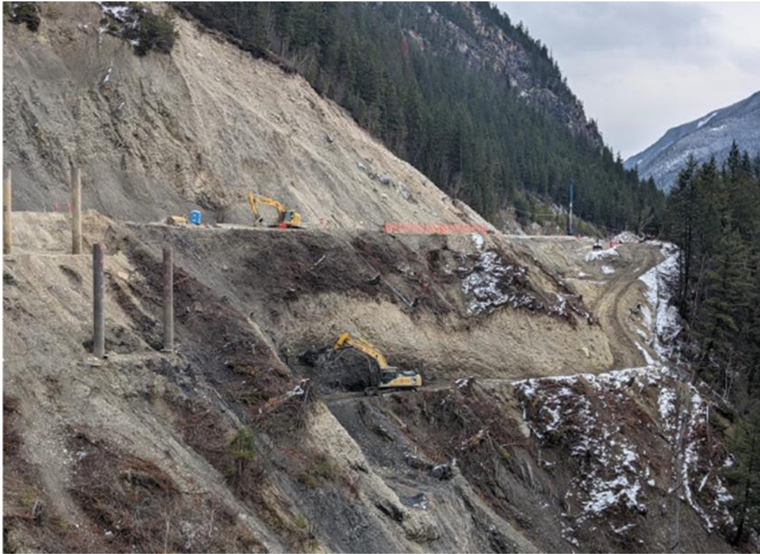
Figure 3: Blackwall Bridge – Crews installing soil anchors – Nov 9, 2021