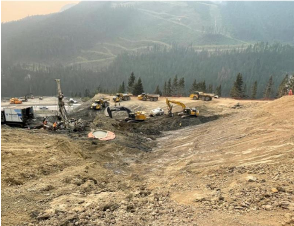
FIGURE 7: CUT 3 - MASS EXCAVATION AND GEOTECHNICAL DRILLING. - JUL 27, 2021