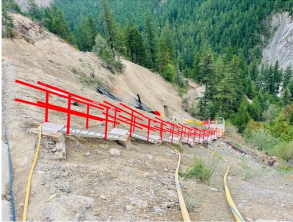
FIGURE 1 – BIGHORN BRIDGE - TEMPORARY ACCESS STAIRS TO MICROPILE OPERATION - JUL 5, 2021