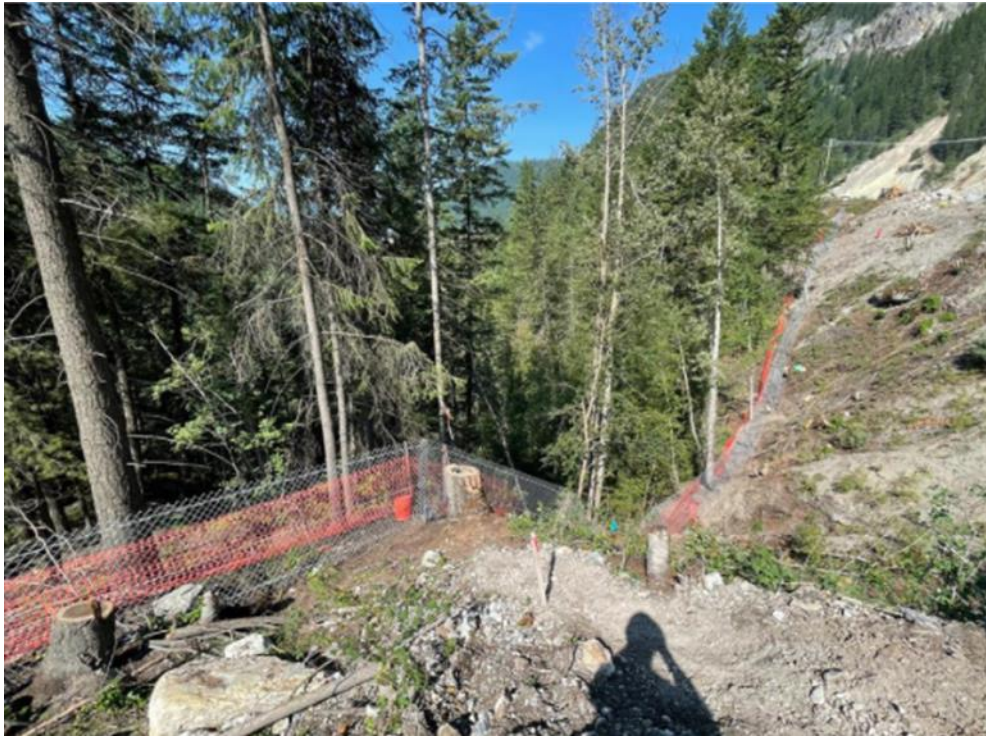
FIGURE 3: MARMOT - GRA COMPLETED 90% OF FENCE. - JUL 8, 2021