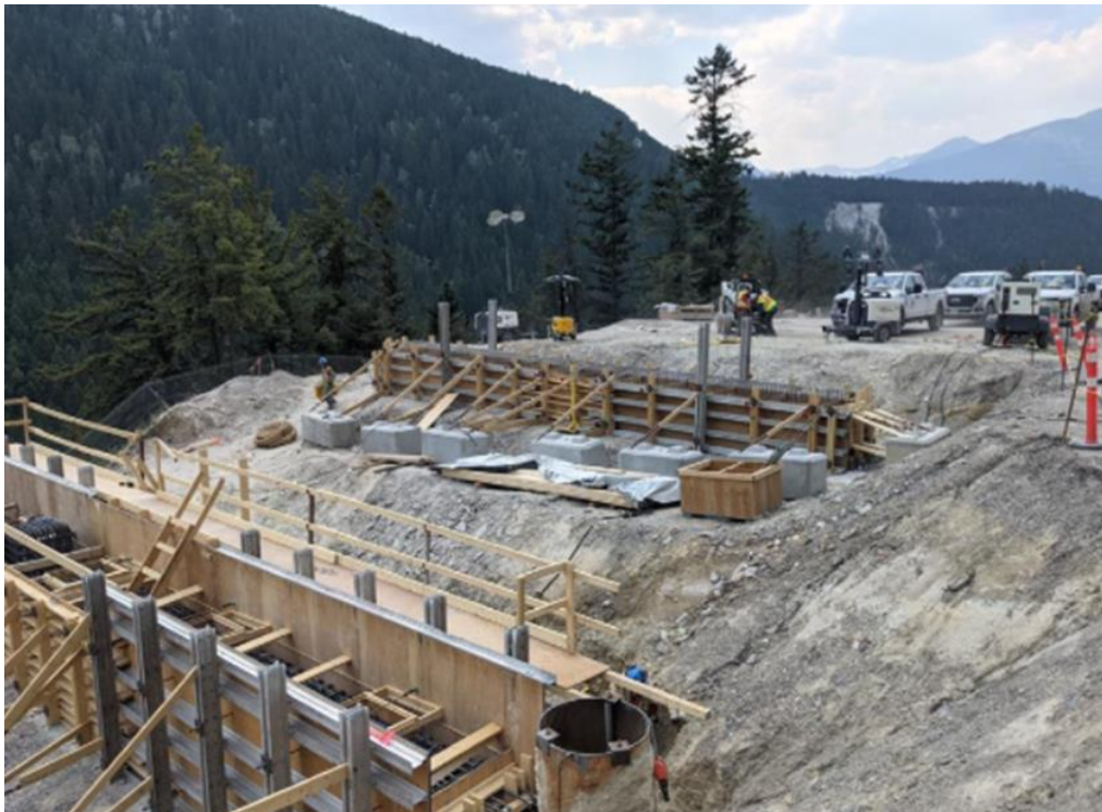
FIGURE 6: KHCC CLEANING AND DOUBLE-CHECKING FORMS FOR CONCRETE POUR AT SHEEP'S BRIDGE. - JUL 21, 2021