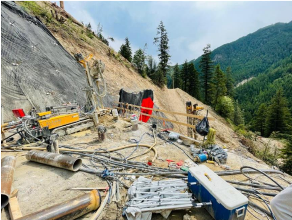
FIGURE 2 – BIGHORN BRIDGE - MICRO-PILE OPERATION CENTRE PIER PILLAR JUL 5, 2021