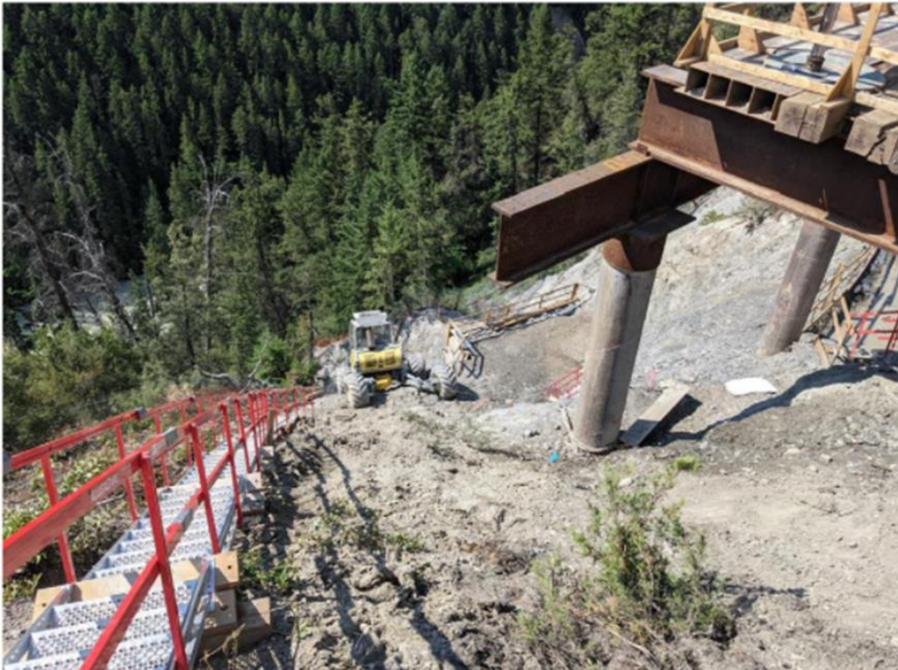
FIGURE 4: SPIDEX EXCAVATOR REMOVING DEBRIS FROM ROCK FENCING - JUL 8, 2021