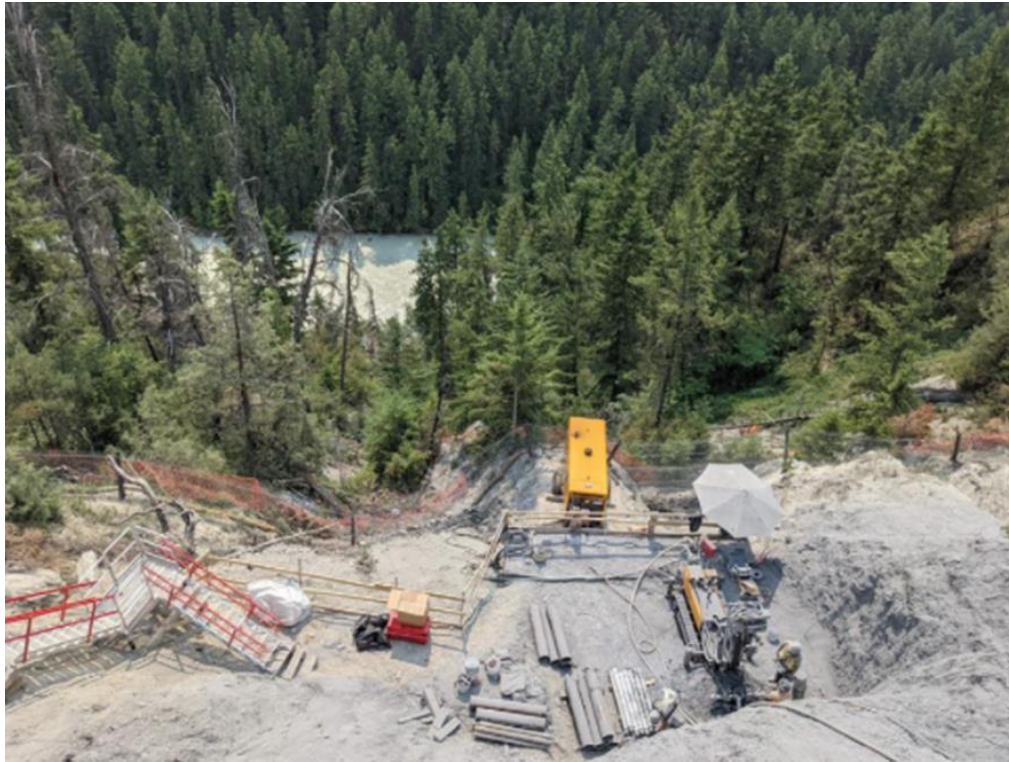
FIGURE 5: CREWS INSTALLING MICRO PILES AT SHEEP'S BRIDGE CENTER PIER - JUL 14, 2021