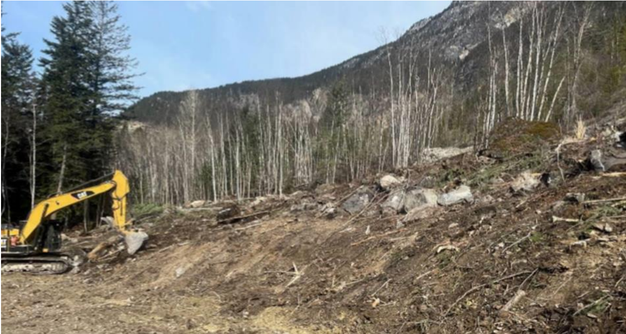
FIGURE 3 –EXCAVATOR CLEARING AND GRUBBING BOULDERS WITHIN THE CARIBOU FILL RIGHT OF WAY.