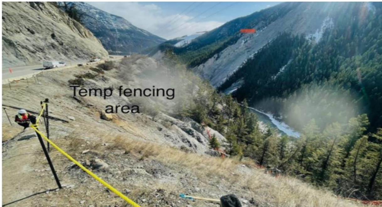
FIGURE 1 – ROCK FENCE AREA BELOW IMPENDING SHEEP BRIDGE CONSTRUCTION.