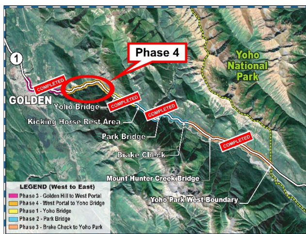
FIGURE 1 – KICKING HORSE CANYON PROJECT PHASES 1-4

Summer traffic volumes exceed 10,000 vehicles per day. The combination of challenging road geometry, high traffic volumes, and no passing lanes results in operating speeds of 55 – 65 km/h. Traffic becomes congested behind slower commercial trucks and recreational vehicles. As a result, the collision rate is more than three times the provincial average for a highway of this type.