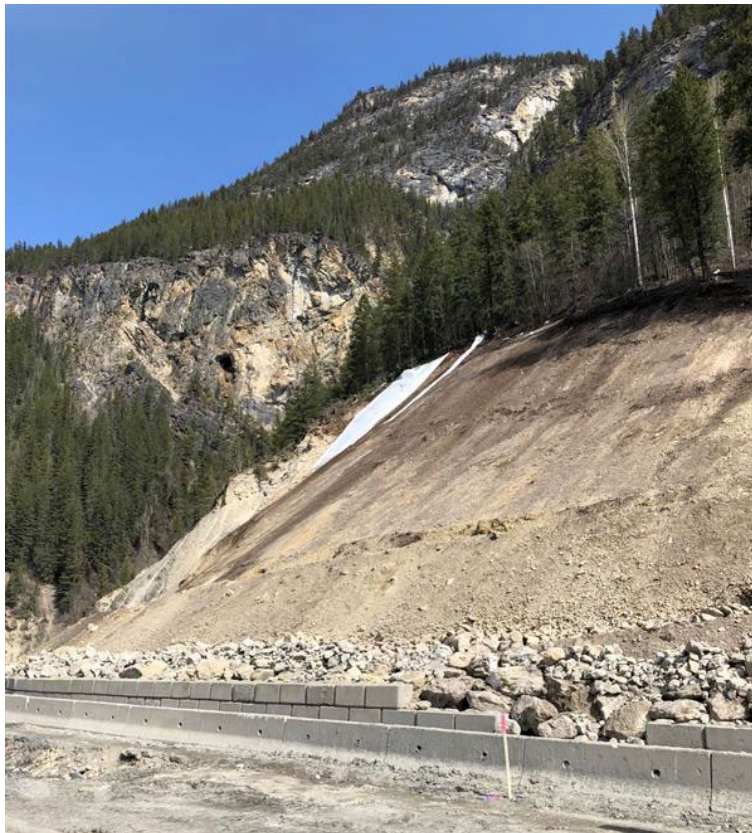
Figure 2: Bison Upslope Wall – Scaling work in progress – Apr. 30, 2022