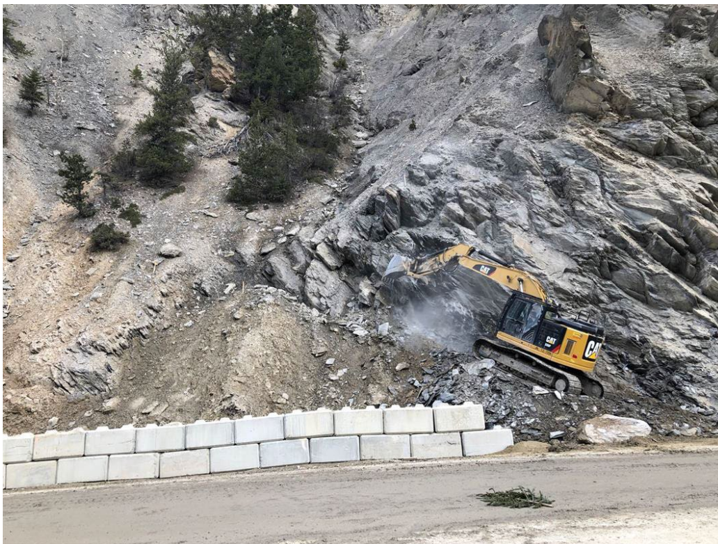
Figure 6: Cut 1 – Pioneering at east end of Cut 1 – Apr. 28, 2022