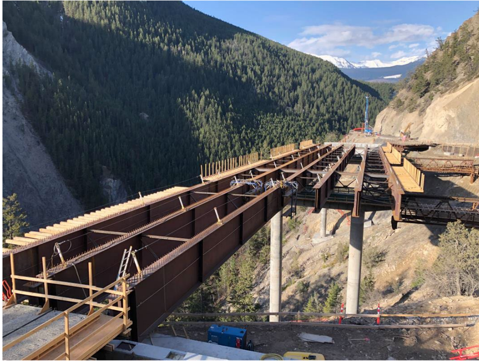
Figure 1: Bighorn Bridge – Girder splicing in progress – Apr. 30, 2022