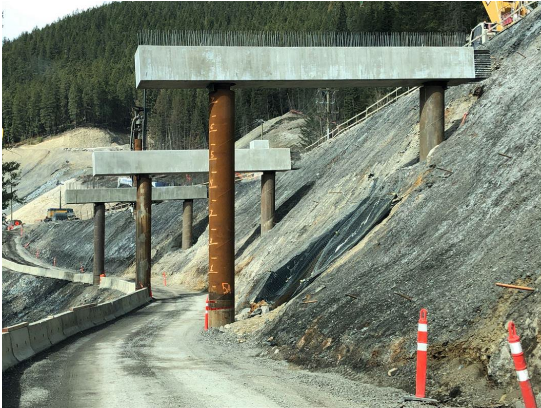
Figure 3: Elk Viaduct – Pier cap installation ongoing – Apr. 29, 2022