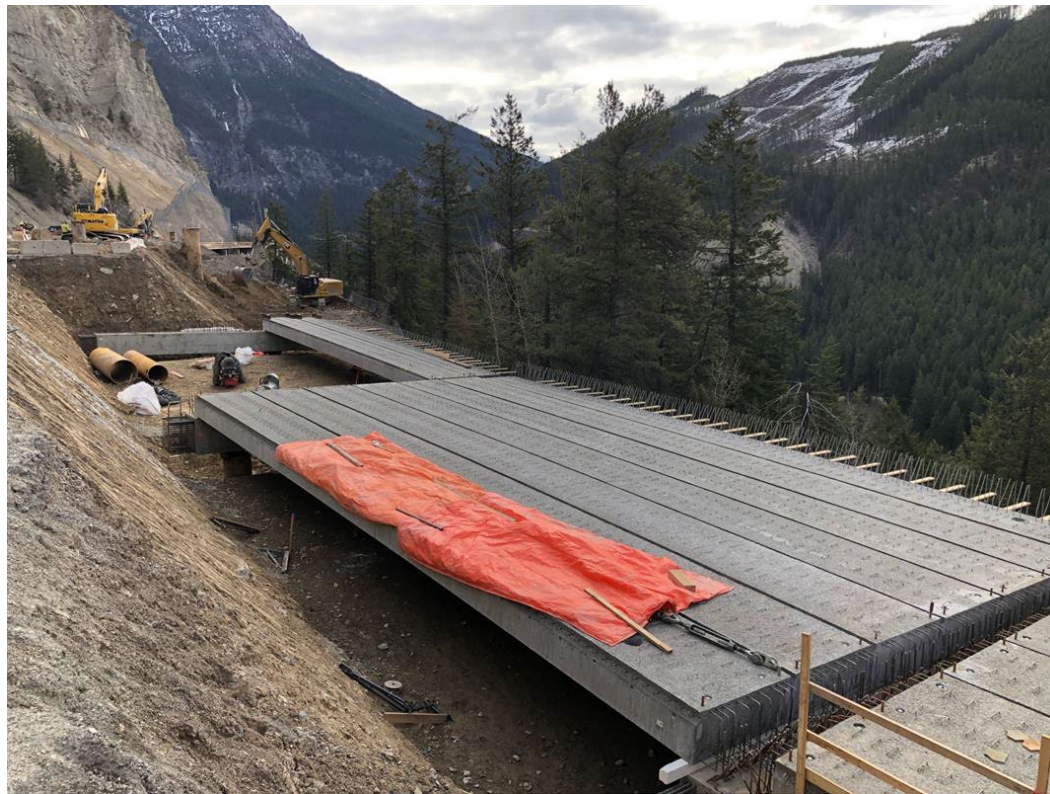
Figure 4: Lynx Viaduct– Box girder installation ongoing –Apr. 28, 2022