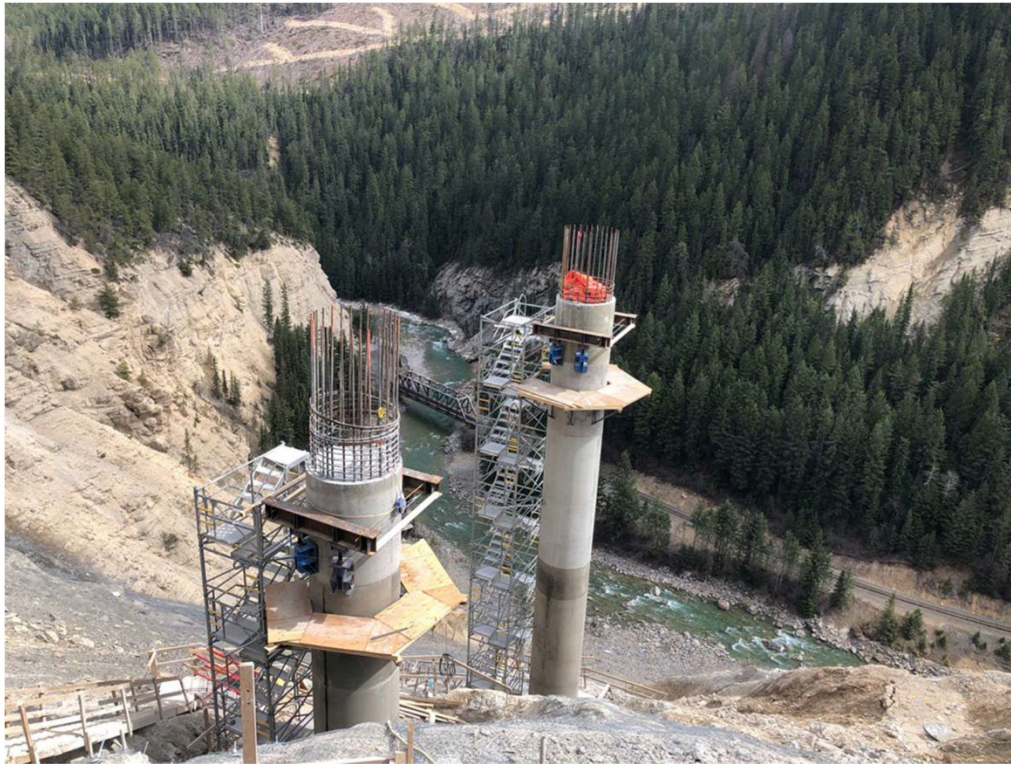
Figure 5: Frenchman's Bridge – Center Pier Columns – Apr. 29, 2022