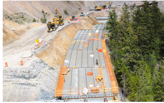
Lynx Viaduct May 2022: Box girder installation nearing completion