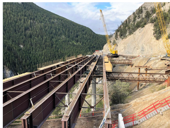
Bighorn Bridge May 2022: Installing girders