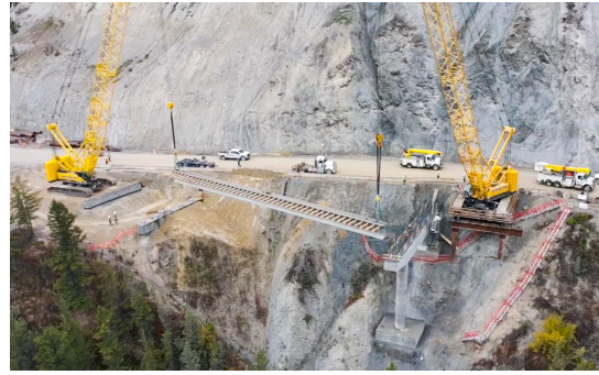
Sheep Bridge October 2021: Girders are installed