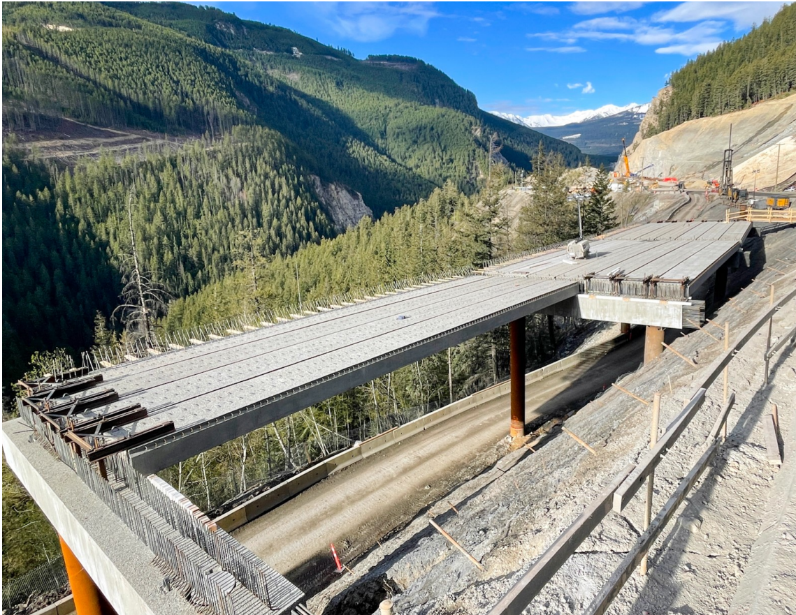
Elk Viaduct girder installation in mid-May 2022: While cranes occupy the highway alignment during the extended closure, the temporary road below this viaduct has been used to provide limited east-west guided access through the site for school buses and local commuters twice daily