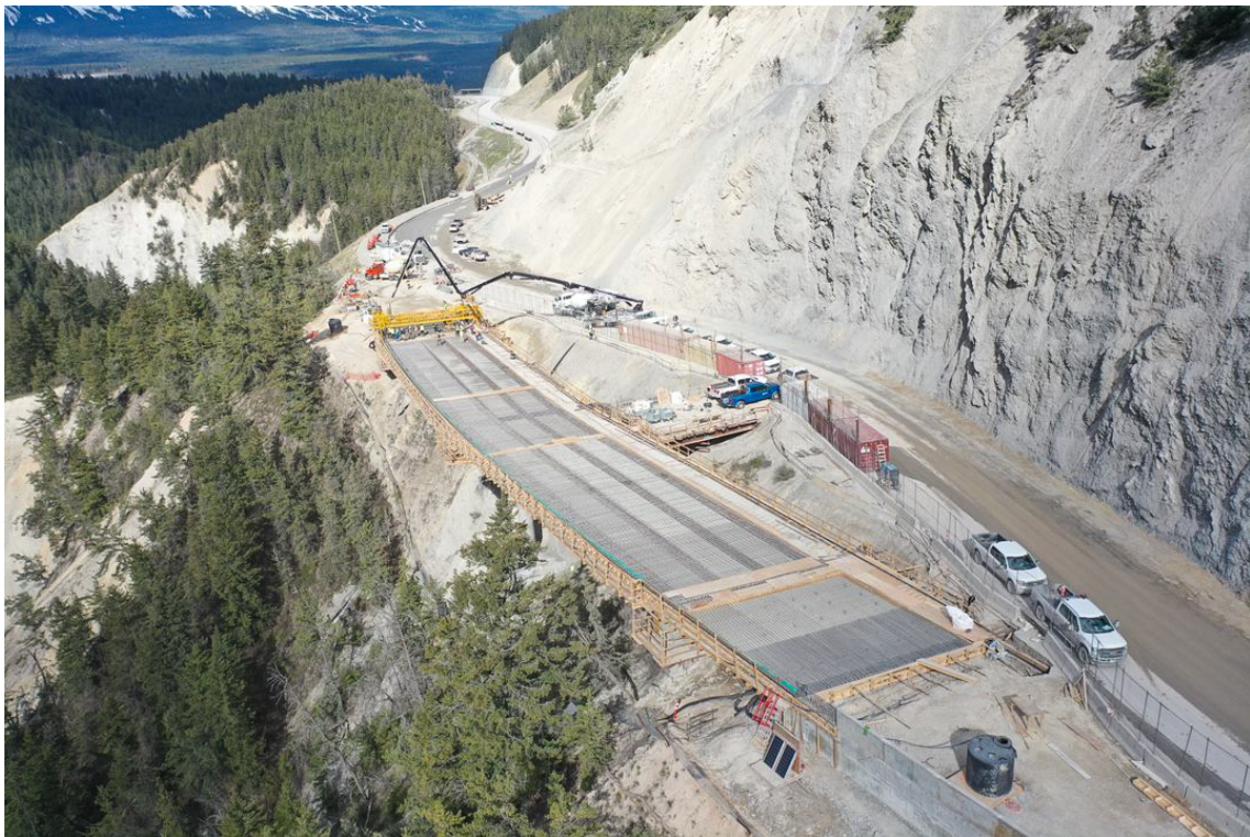
Sheep Bridge May 2022: Concrete bridge deck is poured