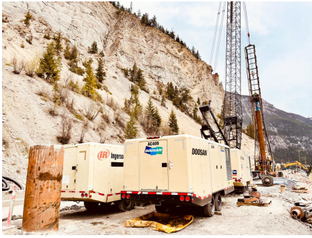
Lynx Viaduct May 2021: Piles being installed