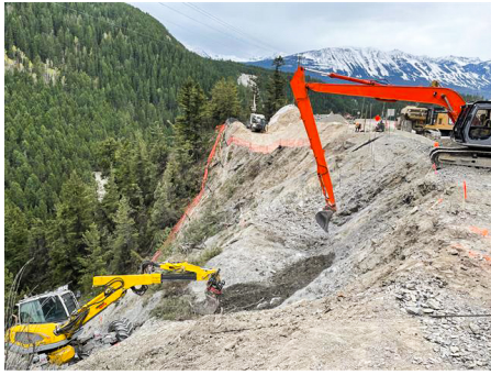
Sheep Bridge May 2021: Building access to begin construction of pier foundation