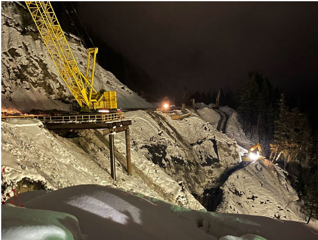
Figure 3: Blackwall Bridge – Nighttime work, centre pier pillar – Jan. 14, 2022