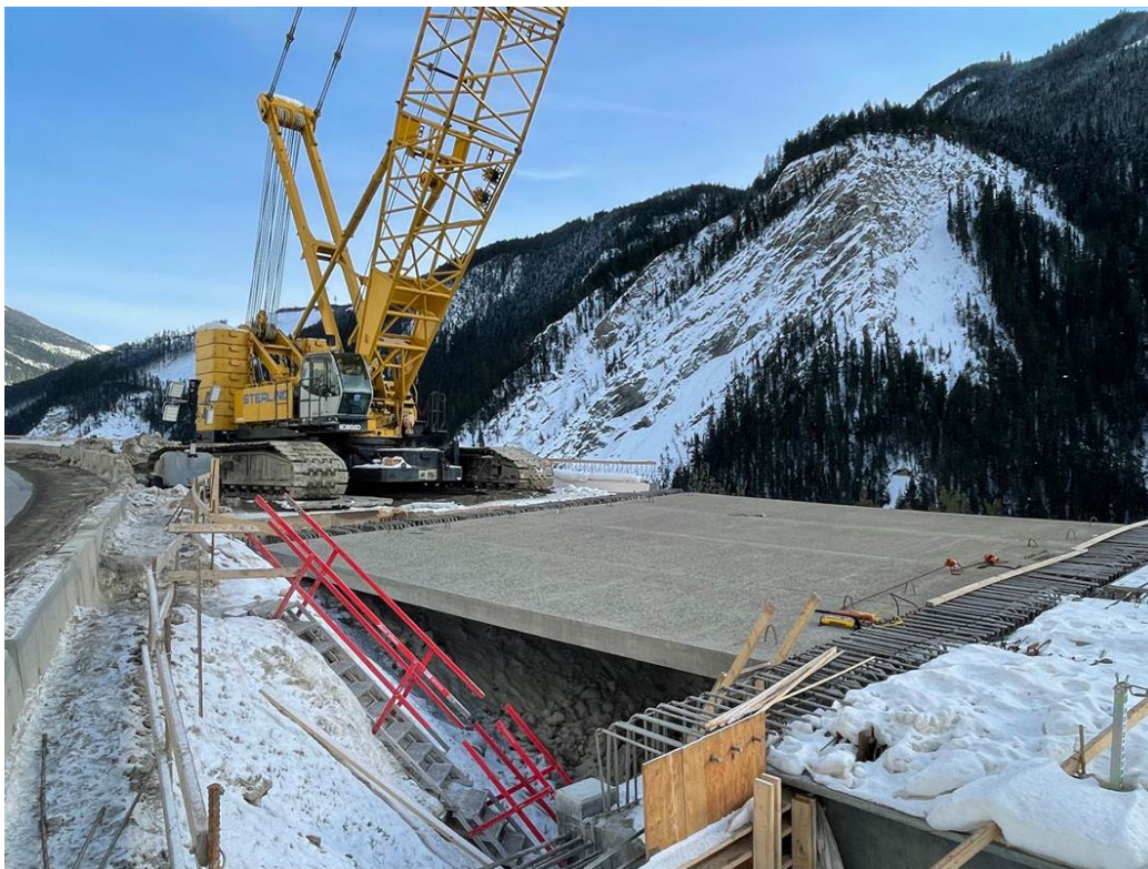
Figure 6: Sheep's Bridge – East transition jump slab – Jan. 19, 2022