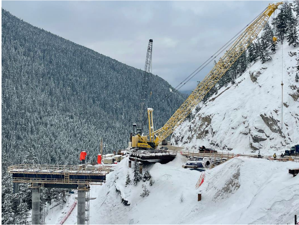
Figure 1: Bighorn Bridge - Pier 1 – Jan. 10, 2022