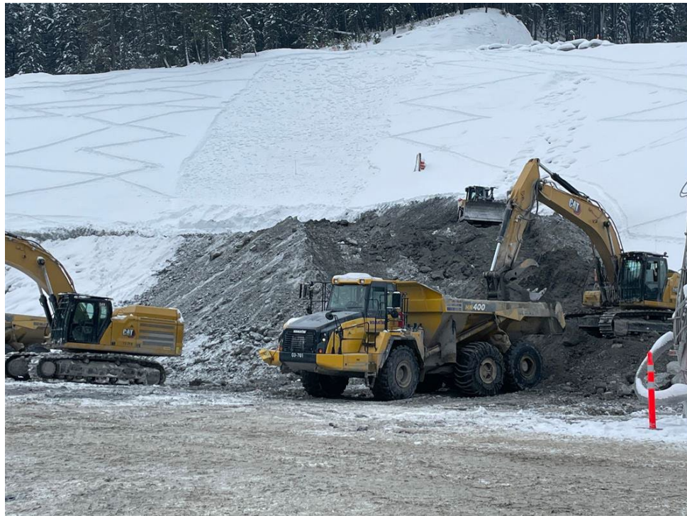
Figure 2: Cut 3 – Removing and hauling material to disposal site – Jan. 10, 2022