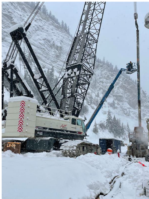
Figure 4: Lynx Viaduct - CDI piling at the west end of Lynx – Jan. 6, 2022