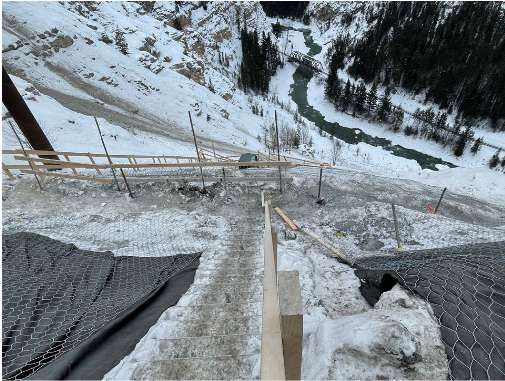
Figure 5: Frenchman's - Bearing pier temporary access – Jan. 28, 2022