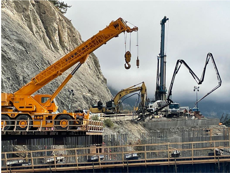
Figure 1: Bighorn Wall - Pile concreting continued; looking east from Sheep west abutment - Oct 1, 2021