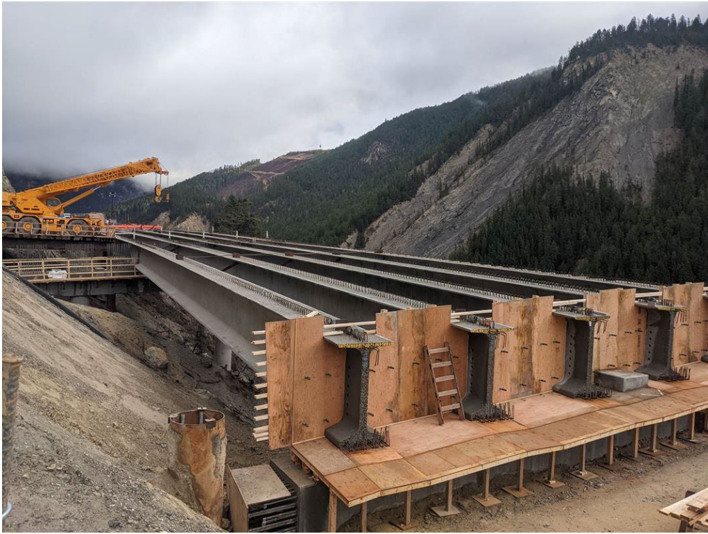
Figure 5: Sheep's Bridge - Looking east - Oct 29, 2021