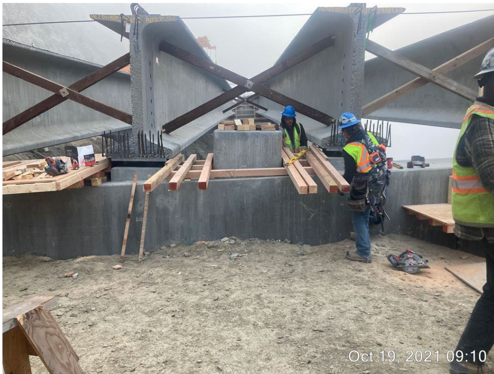
Figure 3: Sheep bridge - Starting formwork for P1 (expansion end) diaphragm - Oct 19, 2021