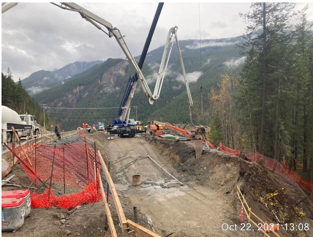
Figure 4: Marmot Viaduct - Concreting piles - Oct 22, 2021