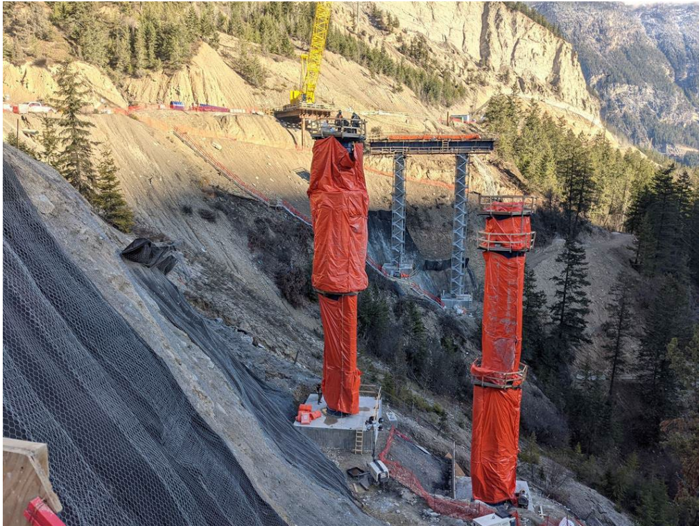
Figure 6: Bighorn – Installing Doka forms on pier 1 Oct 30, 2021