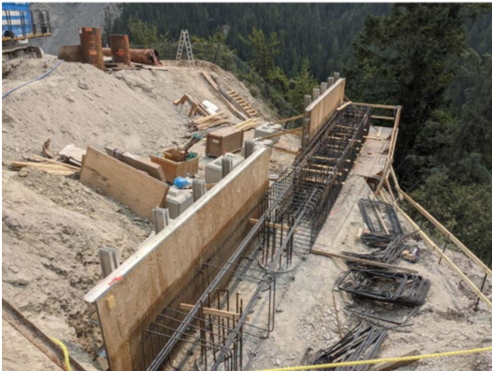
FIGURE 5: HARRIS REBAR CREWS INSTALLING REBARS FOR PILE CAP AT SHEEP'S BRIDGE AUG 14, 2021