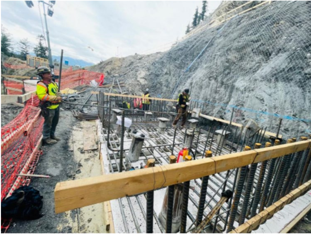
FIGURE 6: SHEEP'S BRIDGE – PIER 2 NORTH PIER CAP AUG 23, 2021