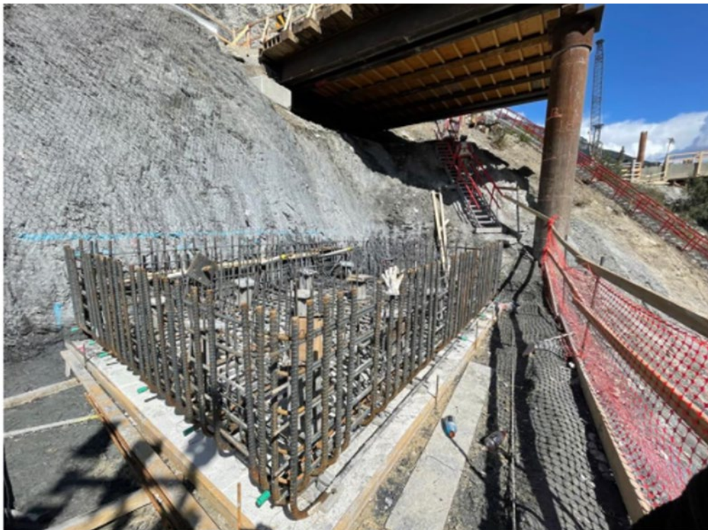
FIGURE 7: SHEEP'S BRIDGE – PIER 2 NORTH PIER CAP REBAR INSTALLATION AUG 24, 2021