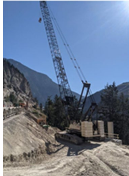
FIGURE 4: EAST ABUTMENT TRANSITION PIER PAD COMPLETED AT BIGHORN AUG 13, 2021