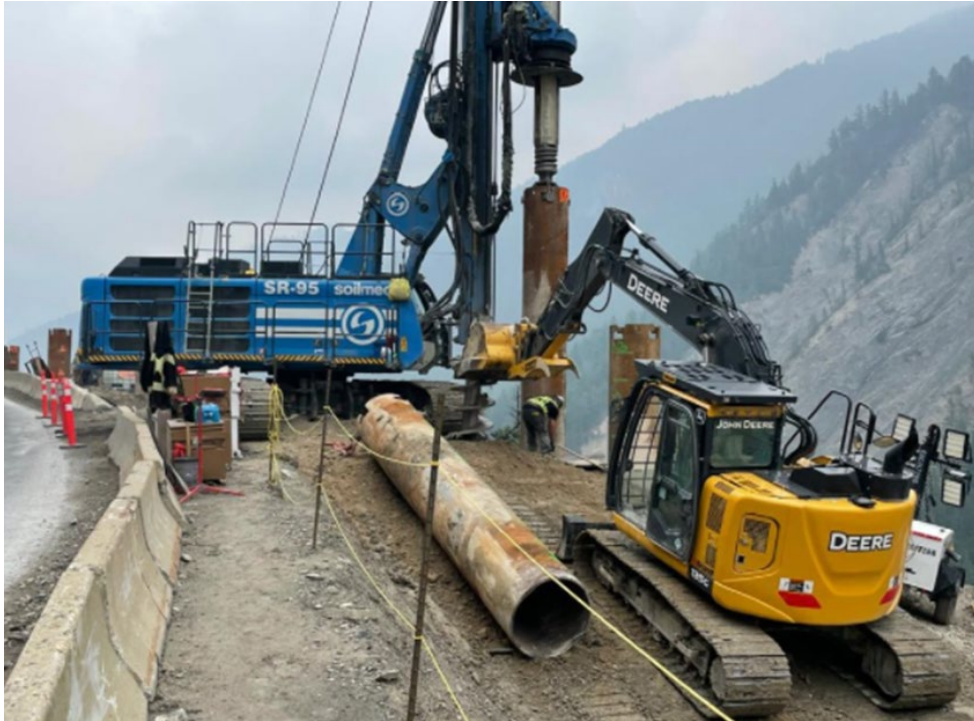
FIGURE 1: BIGHORN WALL – DRILLING 1 ST CASING OF THE 7 TH PILE ALONG THE VIADUCT AUG 3, 2021