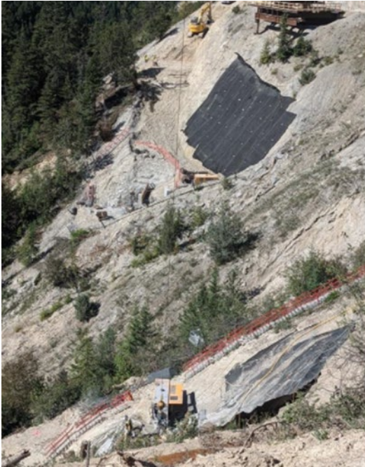
FIGURE 3: BIGHORN – PGE CREWS PREPARING FOR GROUTING AT UPPER BENCH MICRO PILES AUG 13, 2021