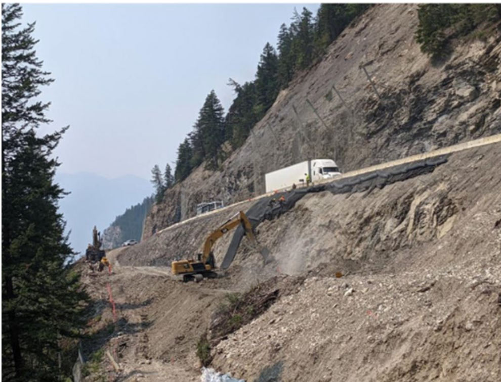
FIGURE 2: KHCC CREWS TRIMMING SLOPE AND INSTALLING WIRE MESH AT GRIZZLY 4 AUG 5, 2021