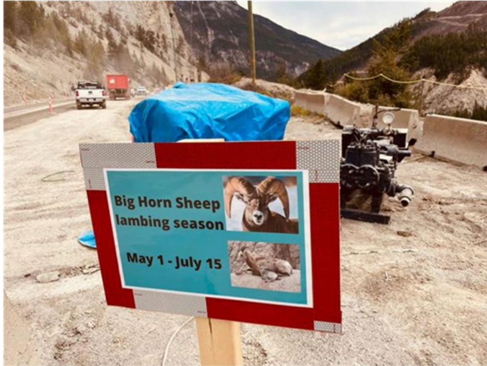
FIGURE 1 – LYNX - SIGN INFORMING CREWS OF CURRENT LAMBING SEASON. MAY 3, 2021