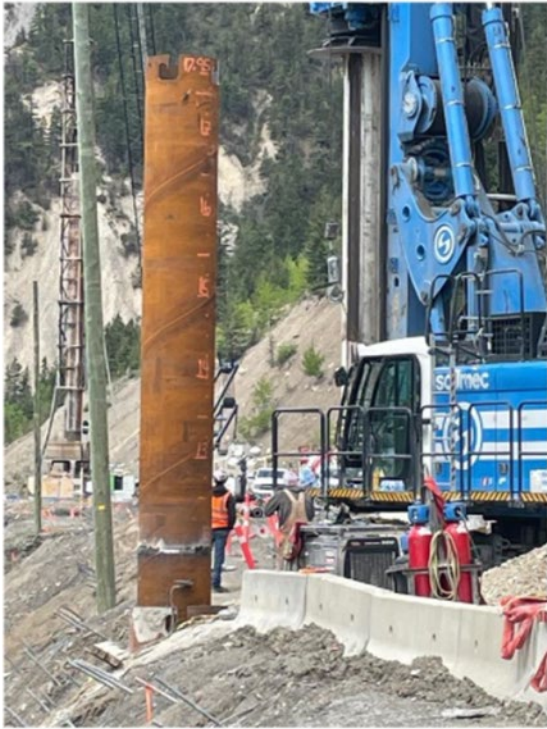
FIGURE 3: CDI SPLICING NEW LENGTH OF PILE AT LYNX EAST; LOOKING WEST - MAY 19, 2021