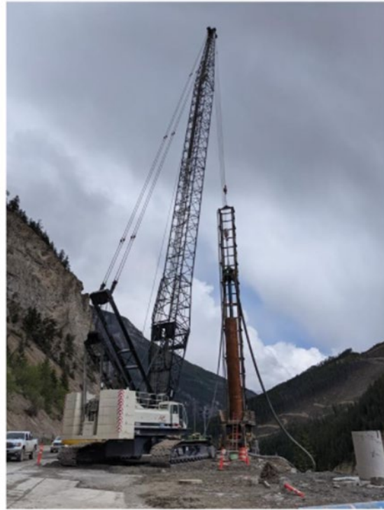
FIGURE 4: CDI CREWS CONTINUE TO INSTALL PILES AT LYNX WEST - MAY 19, 2021