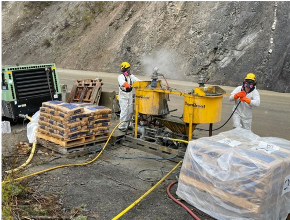
FIGURE 2 – GRA AT GRIZZLY #4; PREP WORK FOR GROUTING - MAY 7, 2021