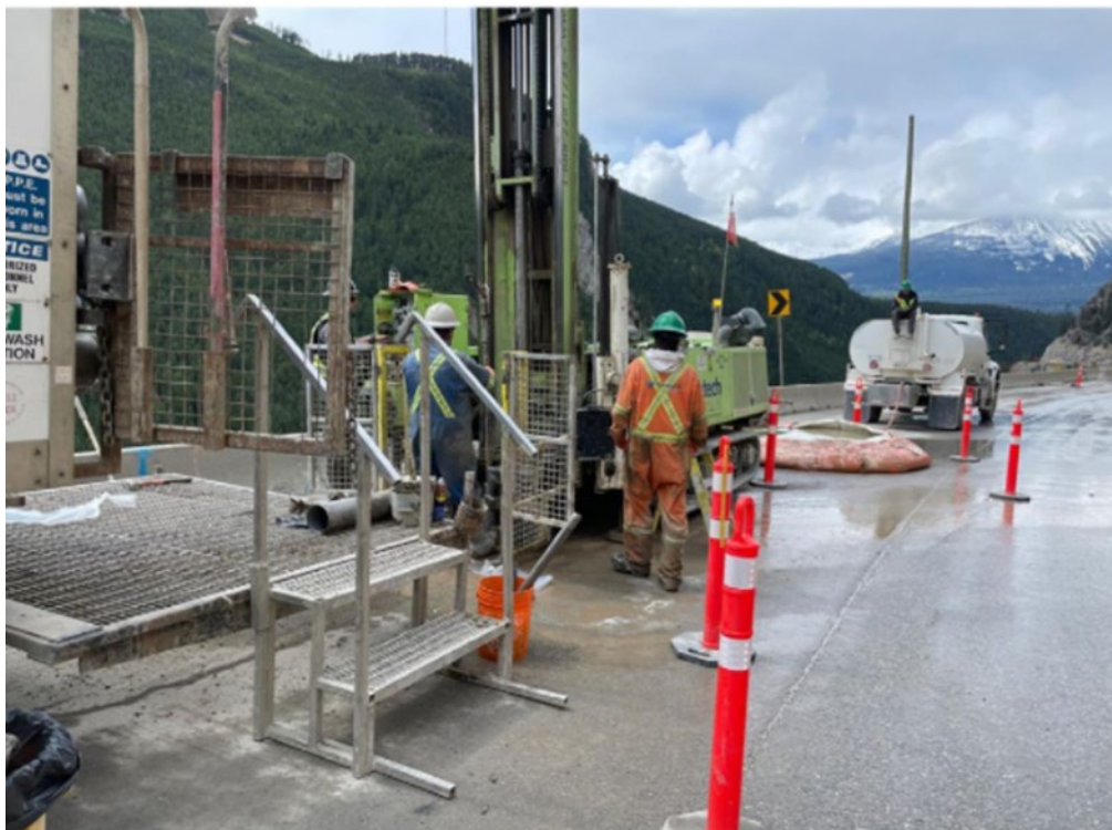
FIGURE 5: CORE DRILLING AT FRENCHMAN'S WEST ABUTMENT; LOOKING SOUTH WEST - MAY 19, 2021