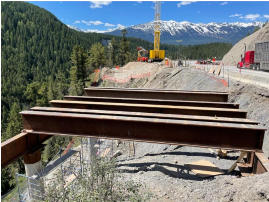
FIGURE 7: SHEEP'S BRIDGE - TEMPORARY CRANE PLATFORM. - MAY 31, 2021