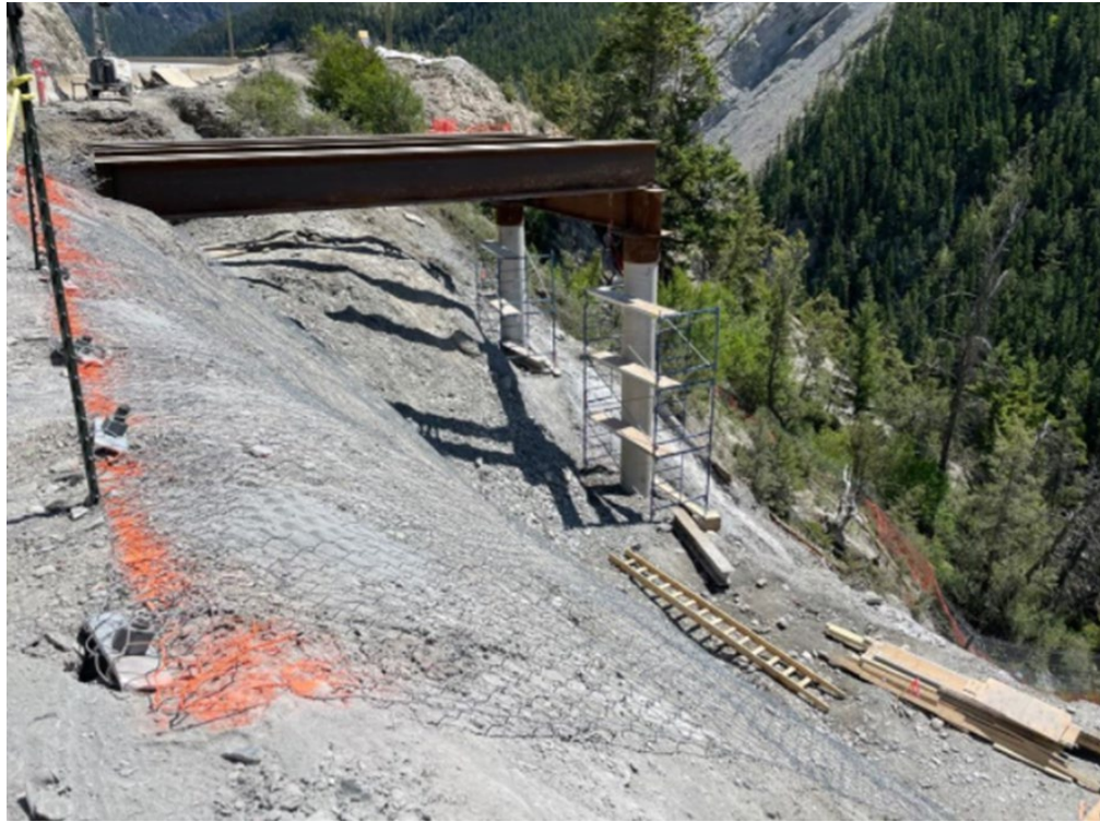
FIGURE 6: SHEEP'S BRIDGE - MESH INSTALLED ON ROCK FACE. - MAY 31, 2021